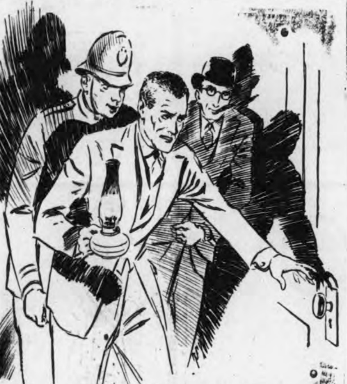
The house looked doubly deserted.

A CONSIDERABLE experience of inquests inclined Kingsley Hylton privately to agree with this