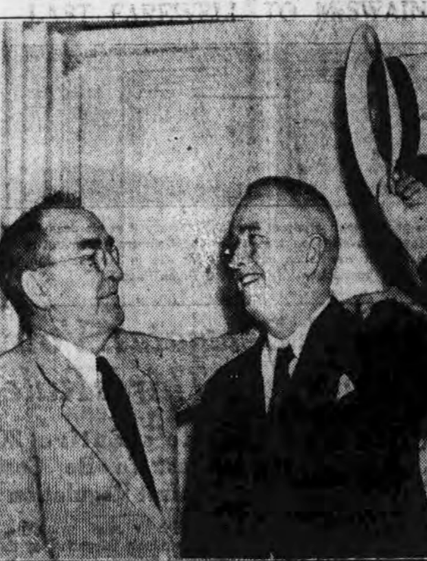
Rep. William B. Sankhead (left) of Alabama, speaker of the house, bids farewell to Rep. John McSwain of South Carolina, chairman of the house military affairs committee, for the last time. After serving in congress 16 years, McSwain is retiring to return to private law practice.

His sketches—for "The Garden of Allah," "Lost Horizon" and "The King Steps Out"—are character together they make a gallery of incisive portraits. He has designed for stage, screen, ballet and for Paris salons. He still does, although he came to Hollywood to "retire."