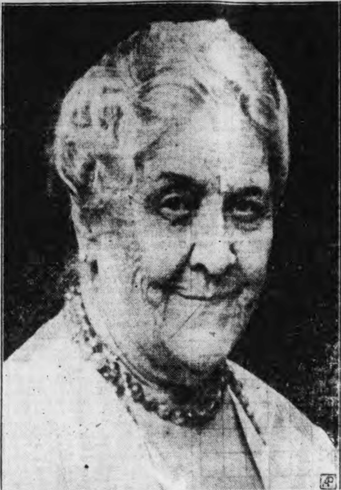
Mrs. James Roosevelt refers to "my son, the President," in a quiet way that nevertheless bespeaks her pride for him.