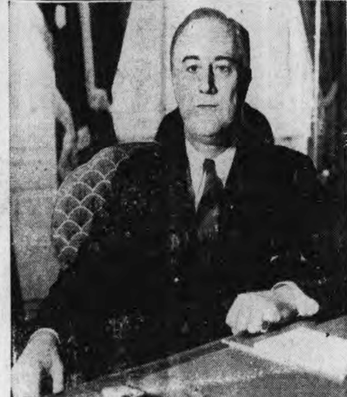
This new photographic study of President Roosevelt at his desk in the White House was made on the eve of the Democratic convention in Philadelphia. It was taken especially for use in his campaign for re-election.