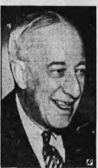
ALFRED E. SMITH

New York, June 23.—(AP)—Chairman John D. M. Hamilton of the Republican national committee today virtually invited former governor Alfred E. Smith to speak in the campaign in behalf of governor Alf M. Landon.