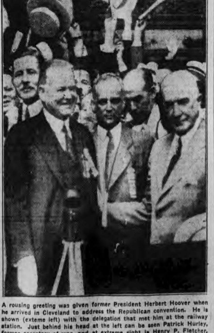
A rousing greeting was given former President Herbert Hoover when he is arrived in Cleveland to address the Republican convention. He is shown (extreme left) with the delegation that met him at the railway station. Just behind his head at the left can be seen Patrick Hurley, former secretary of war, and at extreme right is Henry P. Fletcher, national Republican chairman.

with Blum's background anticipate significant developments in international affairs. Blum was a disciple of Jean Jaures—the French left wing chief who was assassinated at the outbreak of the World War. Jaures was a man of wide influence and so firm an advocate of peace that "he had to be shot before the war could go on."