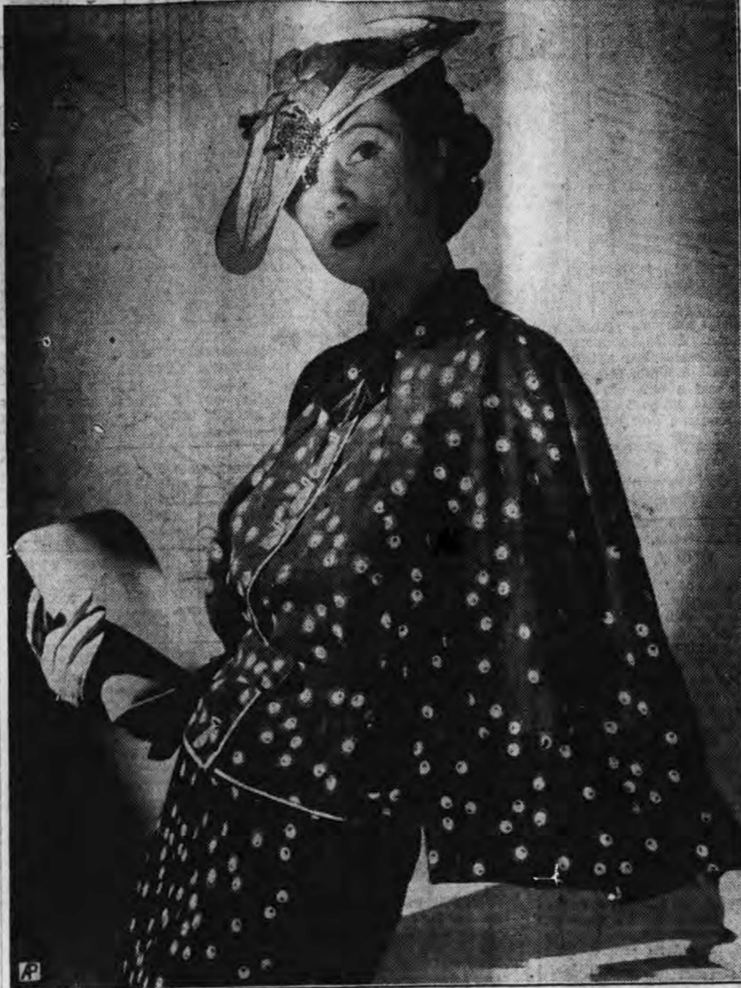
A thousand eyes peer from the sheer silk used to make this navy blue and white combination suit for rock is fastened in front with crystal tassels and topped with a short cape of the same material. Lilly D. aché designs a white straw pancake beret to go with the suit. The outfit is completed by a white doe skin bag and gloves.

rights which may not be violated by cunning, consciencelessness or force. And if such violation takes place, it requires condemnation in the name of God, because by the very act of injustice, the Fatherhood of God is violated. Contemporary social injustice is a violation of basic human rights, and hence of the fundamental principle of religious philosophy. The pulpit of today has no alternative but to face the challenge, and interpret ethics as applied to the economic, social and political life of the day.