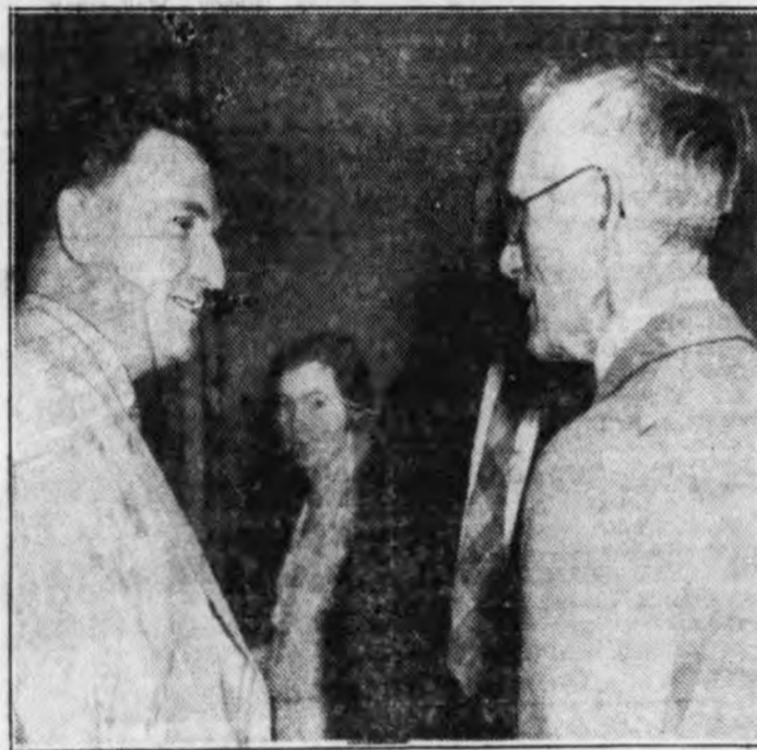
Dr. Francis E. Townsend (right), who told a house committee investigating his old age pension plan that he would form a third political party, is greeted by Rev. Gerald Smith (left), organizer of Huey Long's "Share-The-Wealth" movement. Townsend said, however, that an alliance of his plan, the "Share-The-Wealth" movement, and Father Coughlin's National Union for Social Justice into a third party was not contemplated at present.