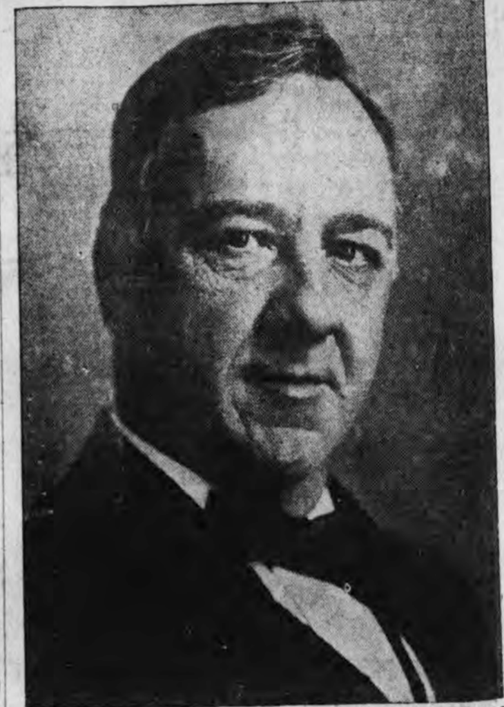
The Honorable Josephus Daniels, Ambassador to Mexico, delivered the address to the graduating class of East Carolina Teachers College today at the final exercises of the commencement.