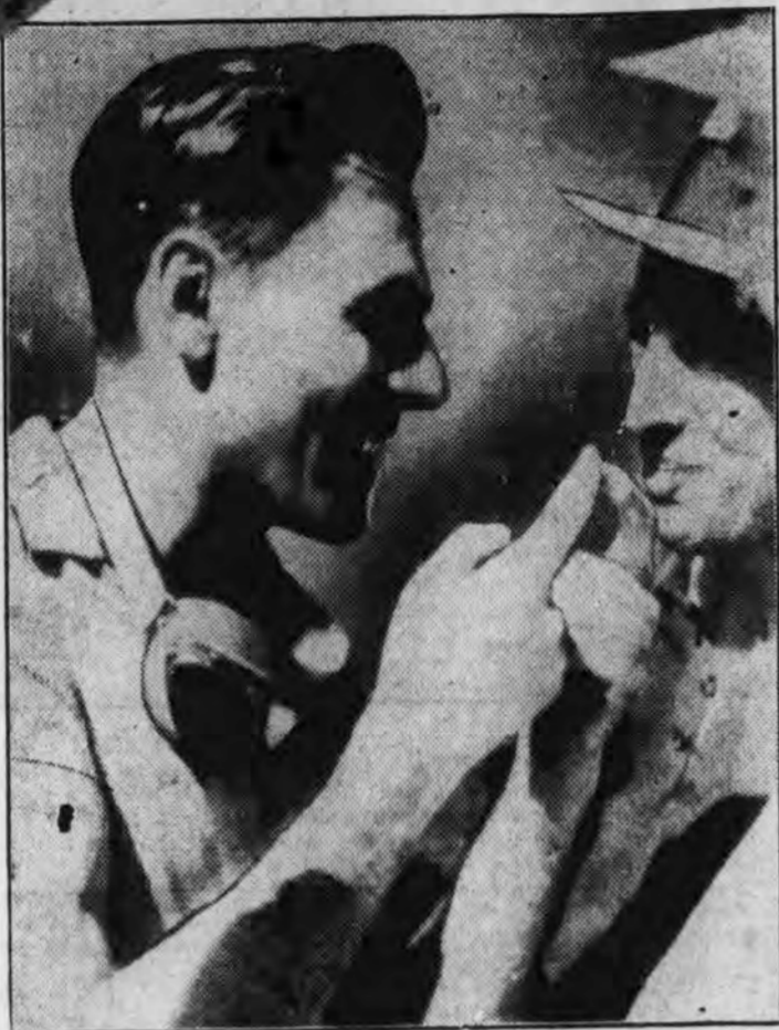
Weary but happy, Lou Meyer beams as friends congratulate him for winning the Indianapolis automobile race in the record-breaking time of four hours, 35 minutes. He covered the 500 miles at an average speed of 109.969 miles per hour.