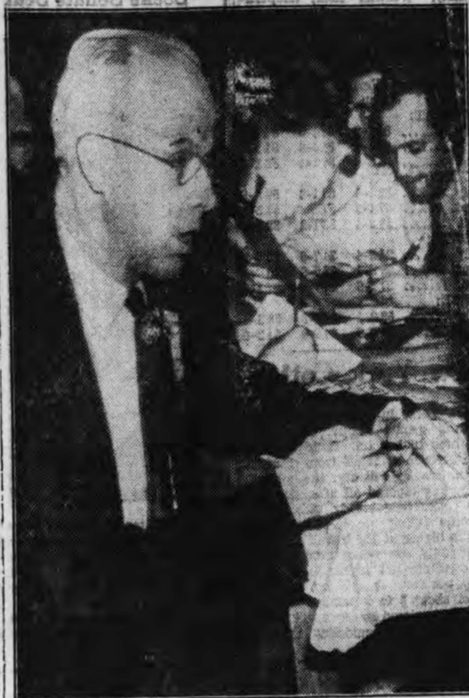
For the third successive time, Norman Thomas was nominated for President of the United States by the Socialist party at its national convention in Cleveland. The white-haired leader is seen working with the New York state delegation shortly before the convention elected him. He was its presidential candidate in 1928 and 1932.