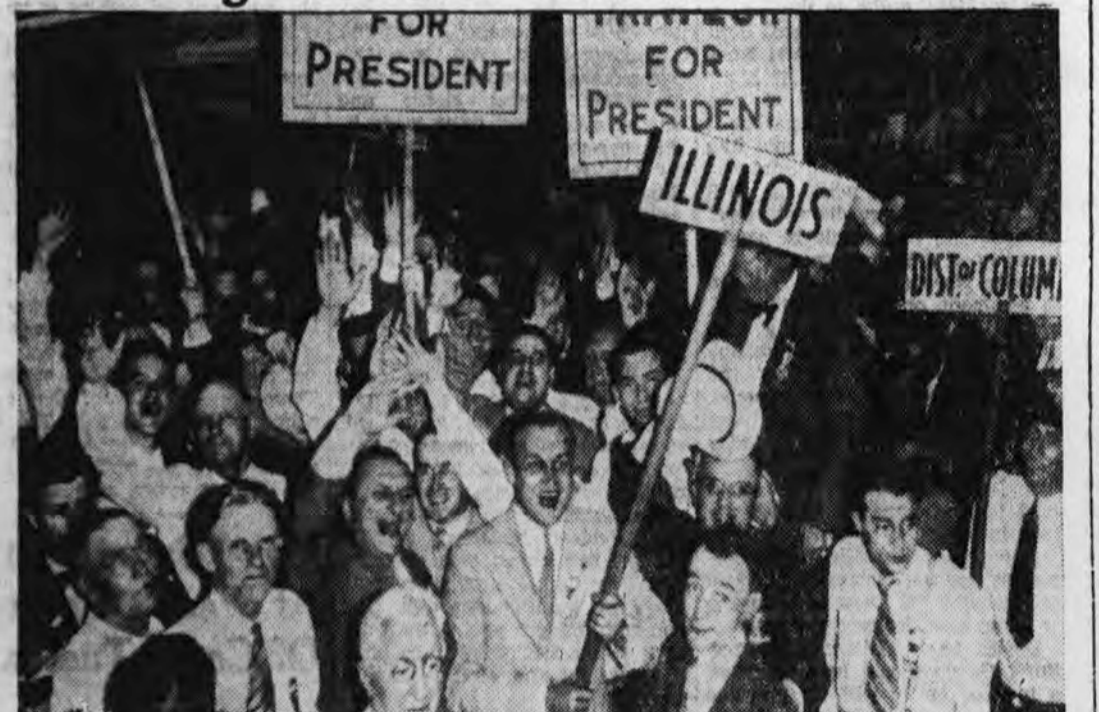
Preceding such demonstrations as this one, snapped as delegates paraded banners and placards around the hall at a national convention, come months of preliminaries which keep political chieftains and underlings busy in every state.

By SIGRID ARNE Washington, May 12.—(AP)—Involved political machinery is grinding away at the job of selecting more than 2,000 men and women to represent the major political parties at their national conventions.