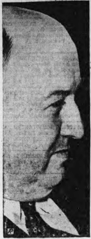
JAMES A. FARLEY

Washington, May 11.—(AP)—Field Marshals Henry P. Fletcher and James A. Farley are rallying their forces in an effort to achieve rousing party solidarity during the Republican and Democratic national conventions in June and the campaign to follow.