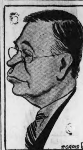
Harold C. Ickes