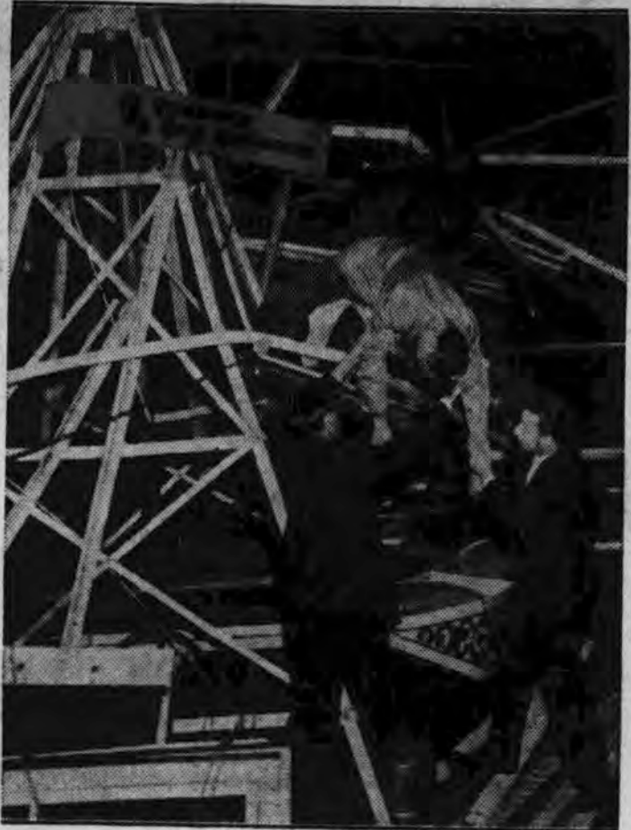
A freakish wind and rain storm that lasted only five minutes, injured 30 persons, flattened a carnival show, damaged numerous buildings and blew down electric wires at Miami, Fla. Fellow workers at the carnival are shown pulling one of the injured, Joe Gowdy of New York, from the wreckage.