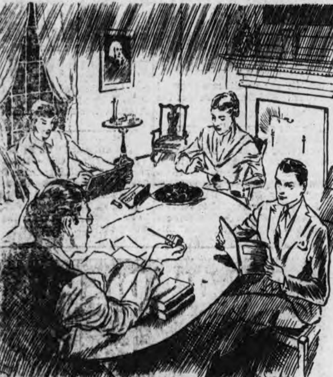
"You mean't think you have to sit here," said Uncle Will.

The boughs he had carried stood about the fireplace. A couple of freshly upholstered deep padded armchairs flanked it. Modern inlaid end-tables beside them were littered