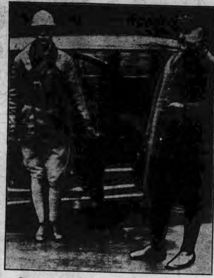
On the eastern frontier where France concentrated great forces after Germany's military re-occupation of the Rhineland, Gen. Jean Guiry (right), commander of the 6th French army corps, is shown in this radiograph as he alighted from his automobile at Metz for an inspection of the area.