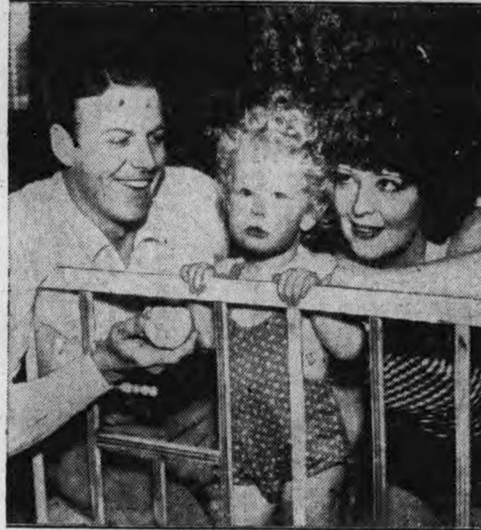
Through with pictures forever, Clara Bow, the "it" girl of the screen just a few years ago, says she is "just beginning to live" in the wide, silent open space at her 360,000-acre ranch on the Nevada desert. The red-head, whose escapades used to make the front pages, is shown with her husband, Rex Bell, and their 14-month-old son on a visit to Hollywood.