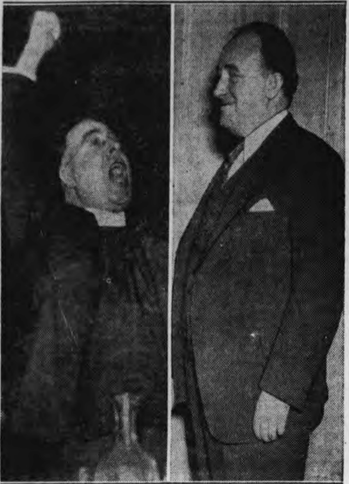
Father Charles E. Coughlin (left), the Detroit radio priest, famous for his political fights, now finds himself in a bitter feud with Congressman John J. O'Connor (right) of New York. Coughlin called the congressman "a servant of the money changers" and O'Connor replied with a threat to kick the priest through the streets of Washington.