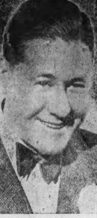
Jack Oakie's clowning contributes to the joy of "King of Burlesque" at the Pitt Tuesday and Wednesday.