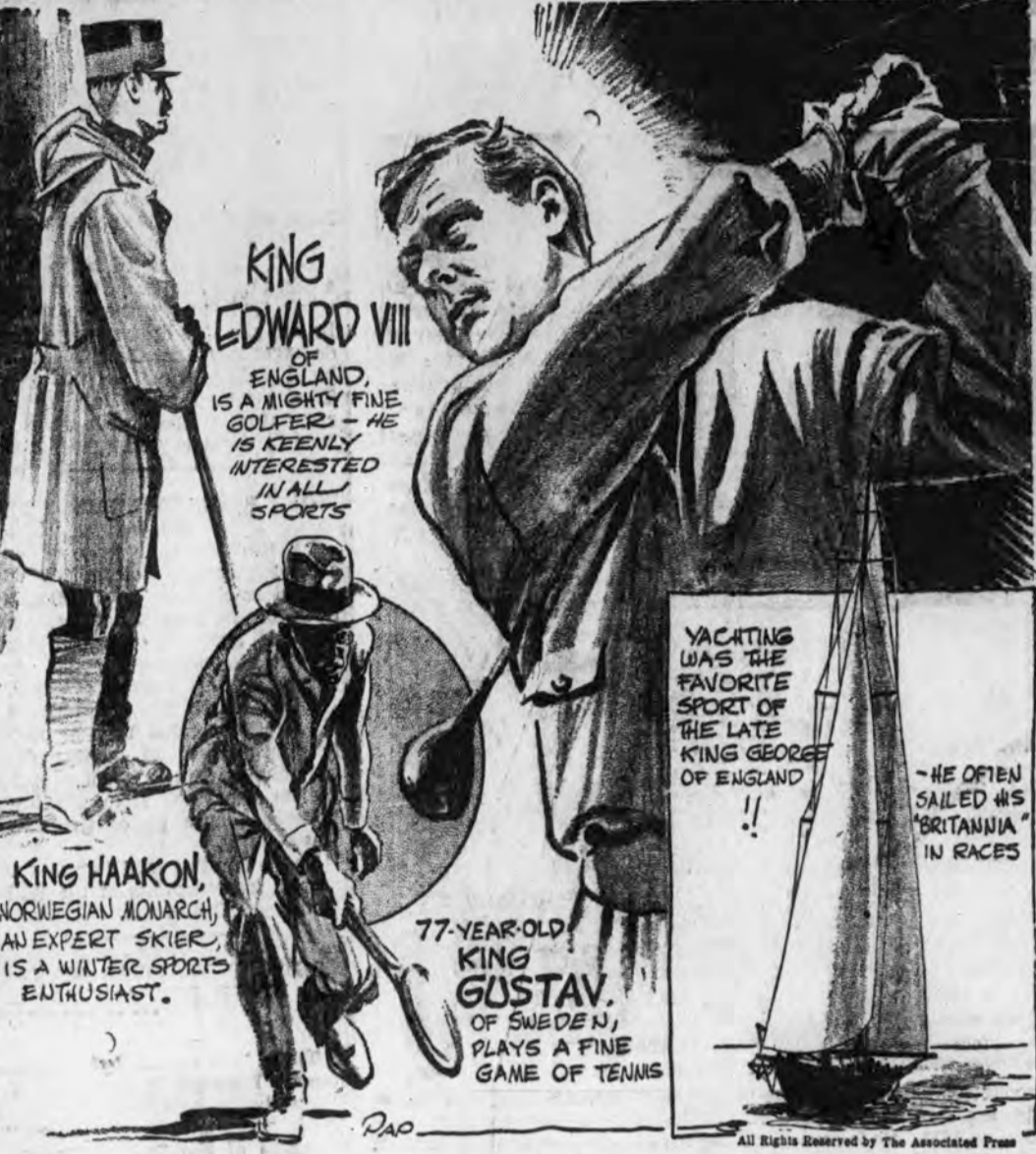
KING EDWARD VIII OF ENGLAND, IS A MIGHTY FINE GOLFER—HE IS KEENLY INTERESTED IN ALL SPORTS