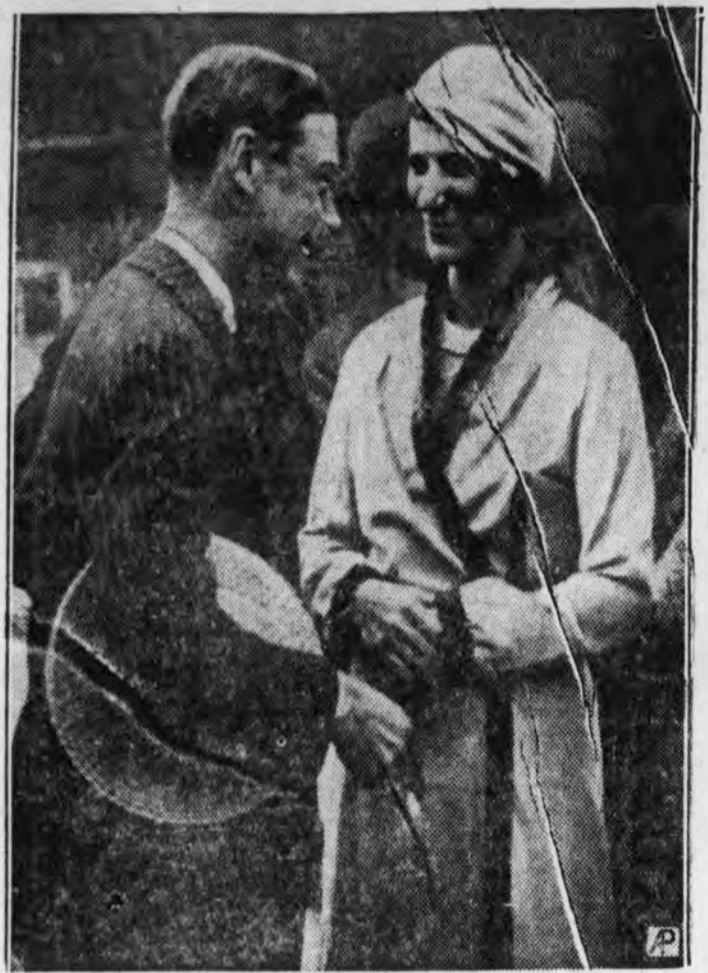
Among his activities as "one-man sales organization" for Great Britain, the new king opened the British Empire exposition in Buenos Aires in 1931. He is seen chatting with his hostess on that occasion.

By JAMES B. RESTON (Associated Press Staff Writer) A "one-man sales organization" for the empire he now heads, King Edward VIII of Great Britain came first to the United States in 1919.