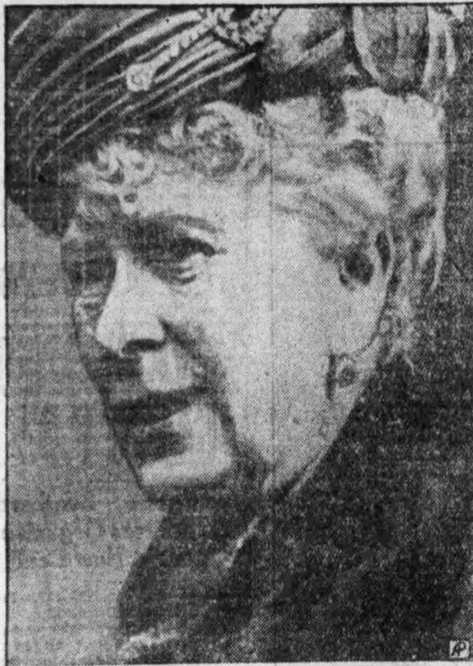
The death of King George of Great Britain has changed the status of his widow. She now is "queen mother," a passive role which probably will free her from many of the formal public appearances which she had to make as wife of the reigning monarch.

Finally there is her church. She is a devout communicant of the Church of England, but prefers "low" services to "high church" ritual.