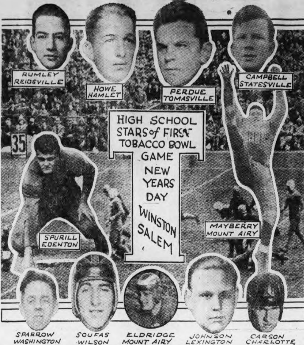
These players were among the high school boys looked to to play an important part in deciding whether the East or the West had the best in gridiron talent. They were among the players invited to take part in the Inaugural Tobacco Bowl game, played today in Winston-Salem. Players for the Eastern team trained here for the battle.