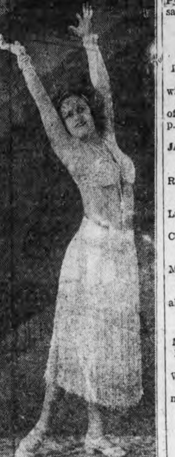
One of the Hula Girls in "Hawaiian Follies" on the stage Monday at the State.