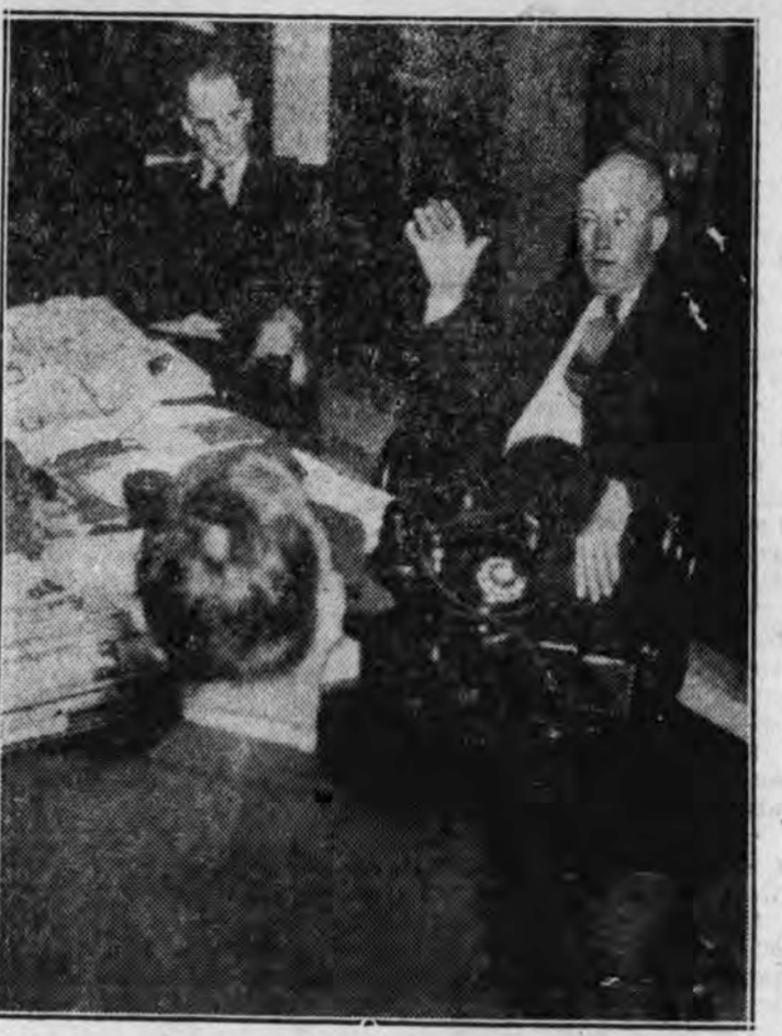
Senator Pat Harrison of Mississippi (right) is shown at a press conference in his office at Washington as he predicted an acceptable soldiers' cash bonus bill will be worked out in conferences between President Roosevelt and congressional leaders. He is chairman of the senate finance committee.