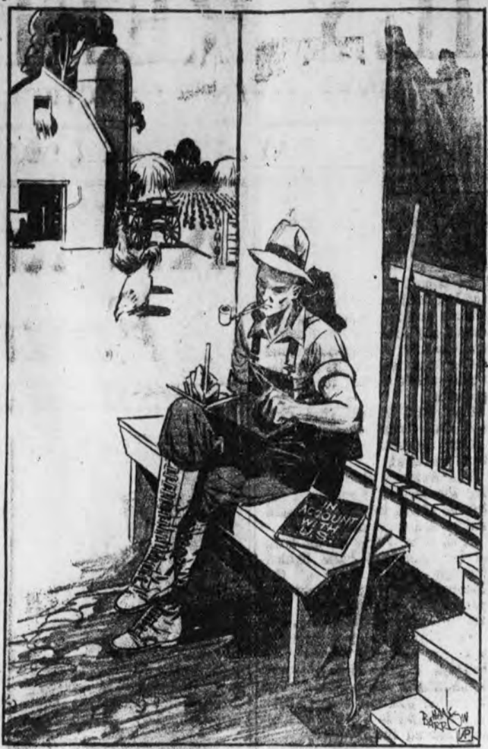
Third in a series of 12 daily articles.