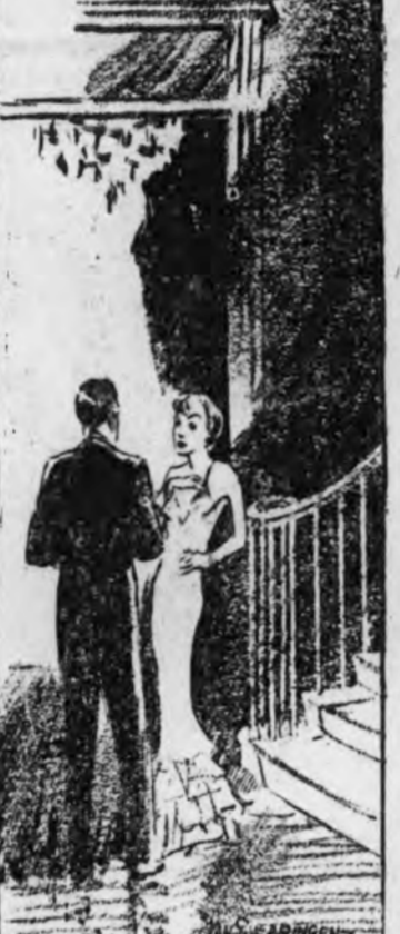
George Fox re-enters the picture, tomorrow.