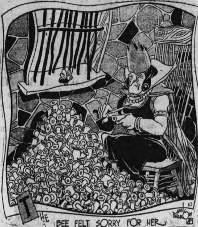
THE BEE FELT SORRY FOR HER

SYNOPSIS: Santa is in trouble because the Iron Queen, held prisoner in toyland, has made a clock which cuts the hours in half. But a magic bee and his friend, the beetle, plan to help Santa.