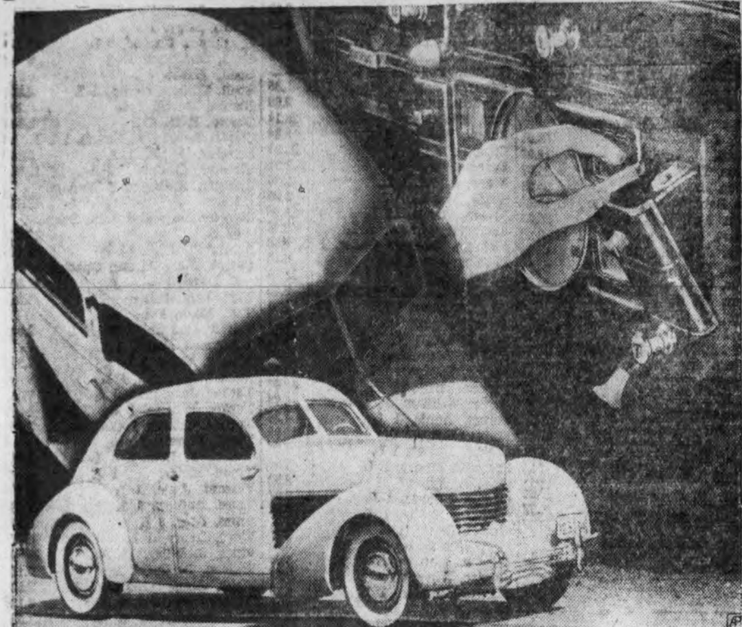
One again the automobile picture changes as manufacturers present new models at a series of shows throughout the country. Above right is one of the new instrument panels designed for beauty as well as convenience. Another model, above left, shows an all-steel body with the "roof" stamped from one piece of steel. Below is an innovation in styling and design, a car only 60 inches high with front drive.

CLOTHING NEWS! Walk 2 Blocks And Save Five to Ten Dollars on Your New Suit or Coat. We have all sizes from 32 to 50. Longs, shorts, slims, Stouts. Fancy or plain backs. We can Fit Any Man at a Great Saving. Come to See Us and Be Convinced. In Tobacco Town. Clark's Suit Shop, Greenville, N. C. Better Clothes for Less!