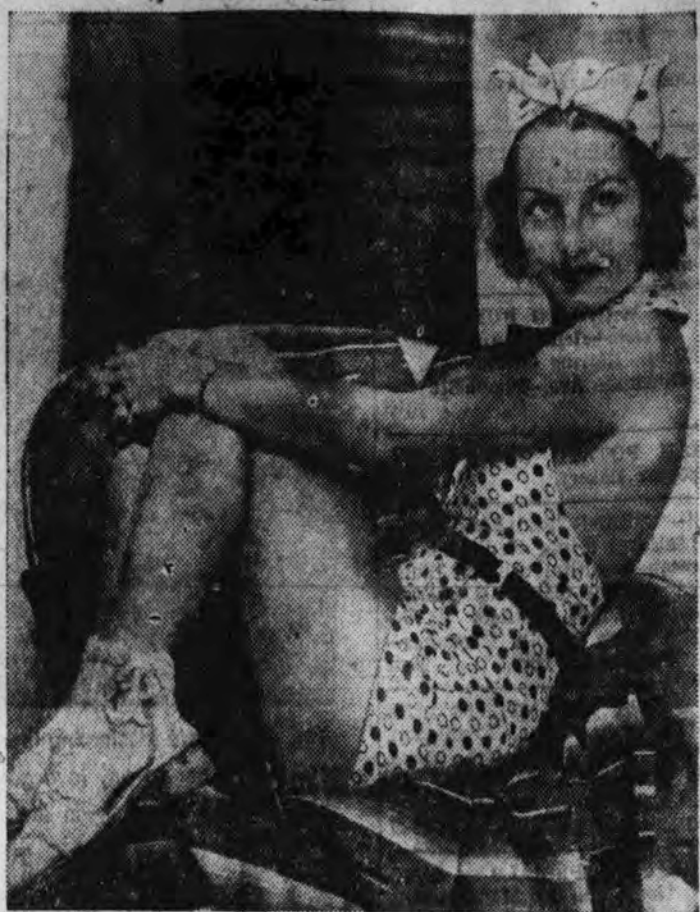
Pretty Rochelle Hudson, film star, brightens life at the Hollywood resorts by wearing the very latest in bathing attire. Here she is shown resting at Palm Springs, Calif., between Hollywood studio duties.