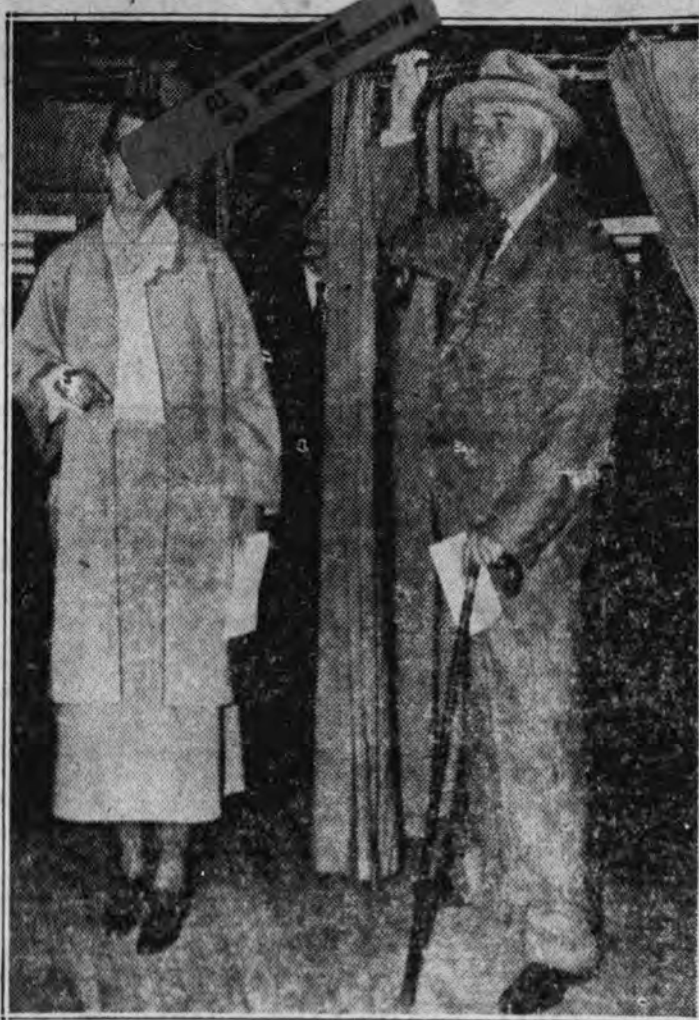
Just like John Q. Citizen and his wife, President and Mrs. Franklin D. Roosevelt are shown casting their ballots at the Hyde Park, N. Y. Town Hall in the state election. They carefully withheld predictions of the outcome. Subsequent returns gave republicans control of the state assembly.