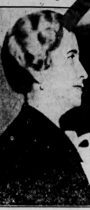
At last Mrs. Grace Coolidge, widow of the late President Calvin Coolidge, has kocked her hair. This picture shows a side view of the bob which she got while visiting friends near Tryon, N. C.