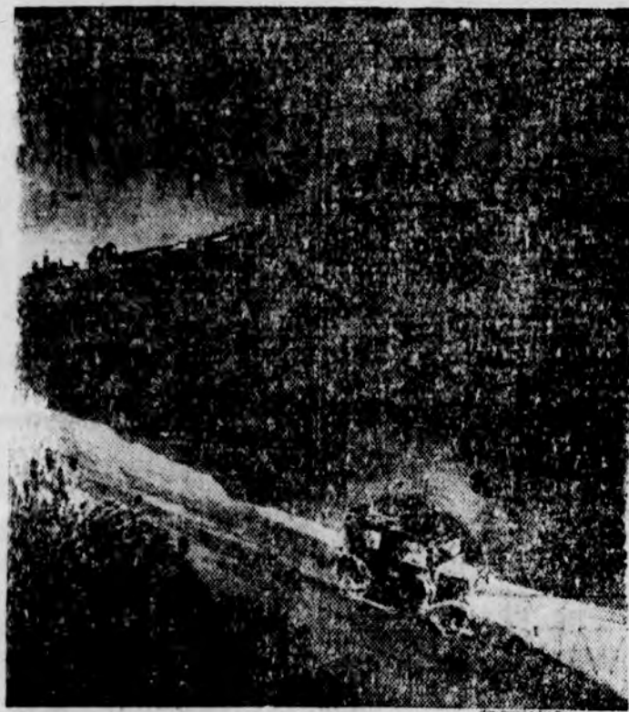
The chauffeur objected to the lonely drive.

A serious and thoughtful girl, older than her age although a retroussé nose and round, child-like face made her look younger, she had spent thirty-six apprehensive hours travelling from Switzerland to Dover, determined that whatever