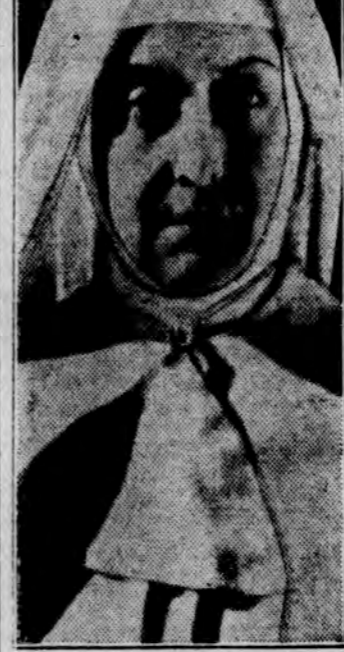
Clara Kimball Young, whose screen appeal once brought her a $200,000-a-year income, is shown in the costume she wore when friends discovered her playing an "extra" role in Hollywood.