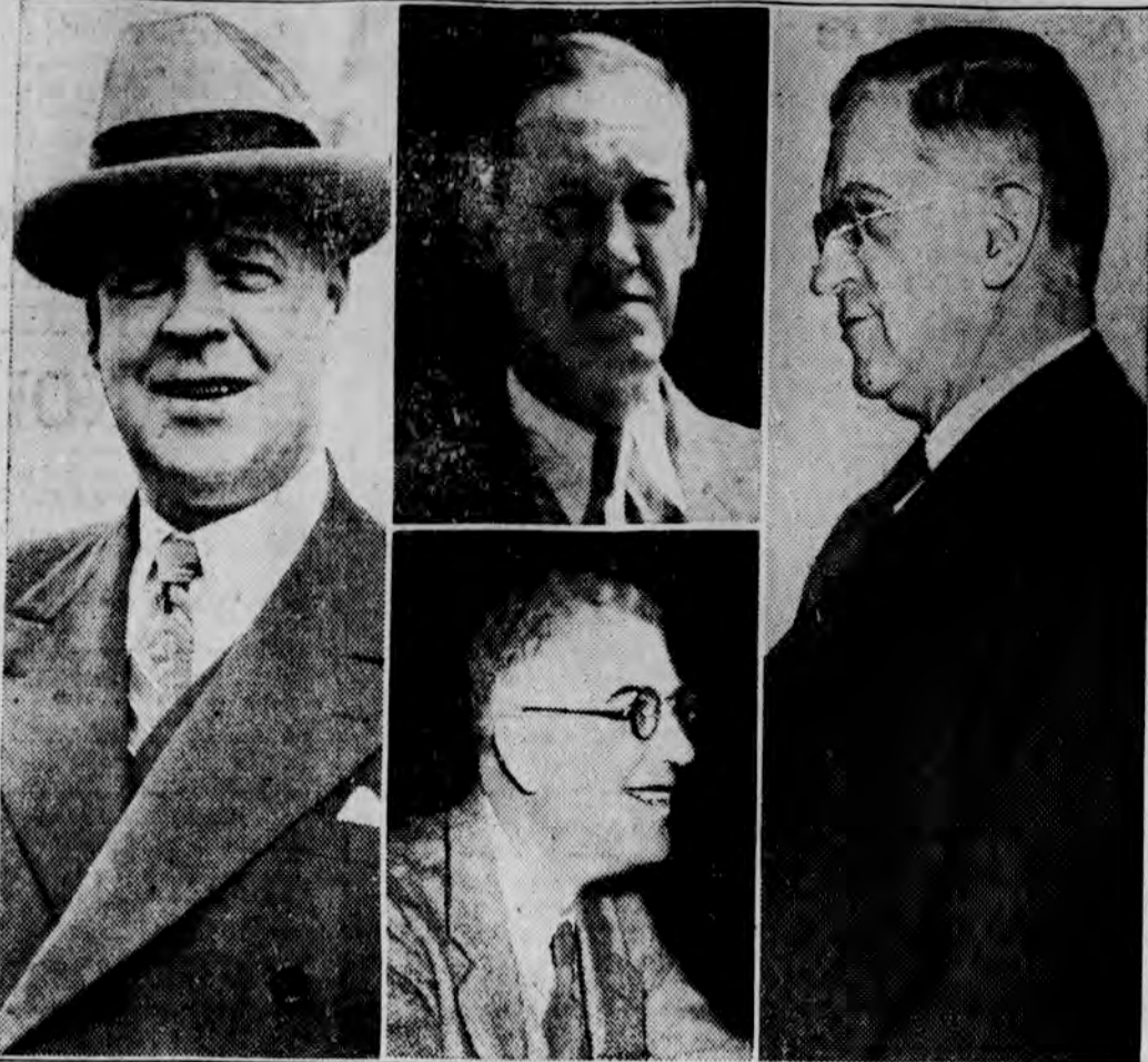
Here are the Big Four of the organization which President Franklin D. Roosevelt has set up to administer the four billion dollar relief program authorized by congress. Left is Frank C. Walker, director of the emergency council which will act as a clearing house for project applications; top center is Harry L. Hopkins, who will head the works progress division which is to make certain that persons employed on projects come from relief roles. Lower center is Dr. Rexford G. Tugwell, head of the division for rural re-settlement, and at right is Secretary of the Interior Harold L. Ickes, chairman of the allotment board of 22 which will meet weekly and recommend projects to be undertaken.