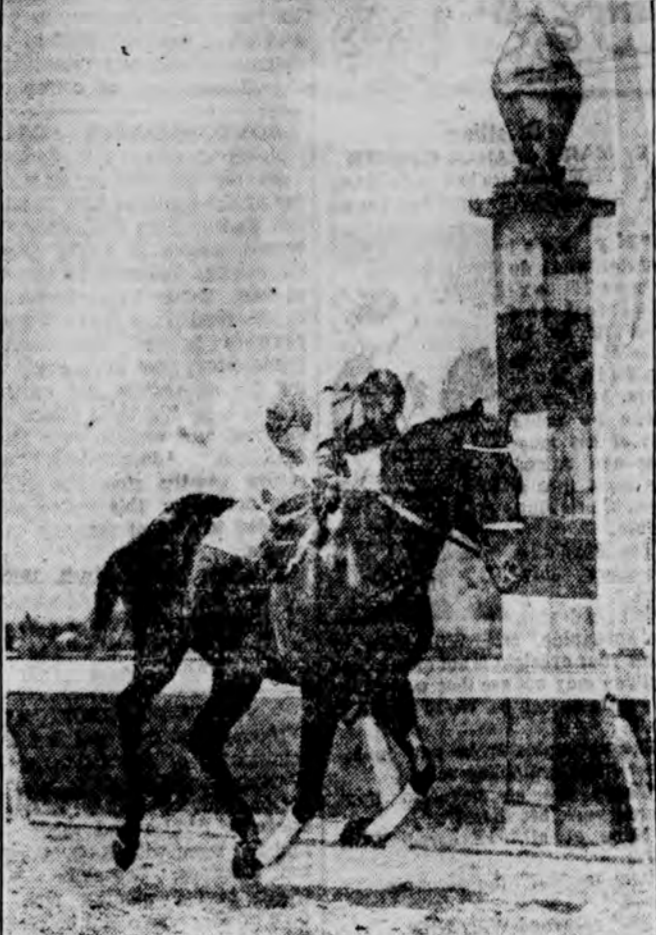
Down in the blue grass country they are picking Boxthorn, Bradley farms colt, to finish in front in the Kentucky Derby. With Don Meade, ace of the Bradley riding staff, up, Boxthorn in one workout went the full derby distance of ten furlongs in 2:12 flat.