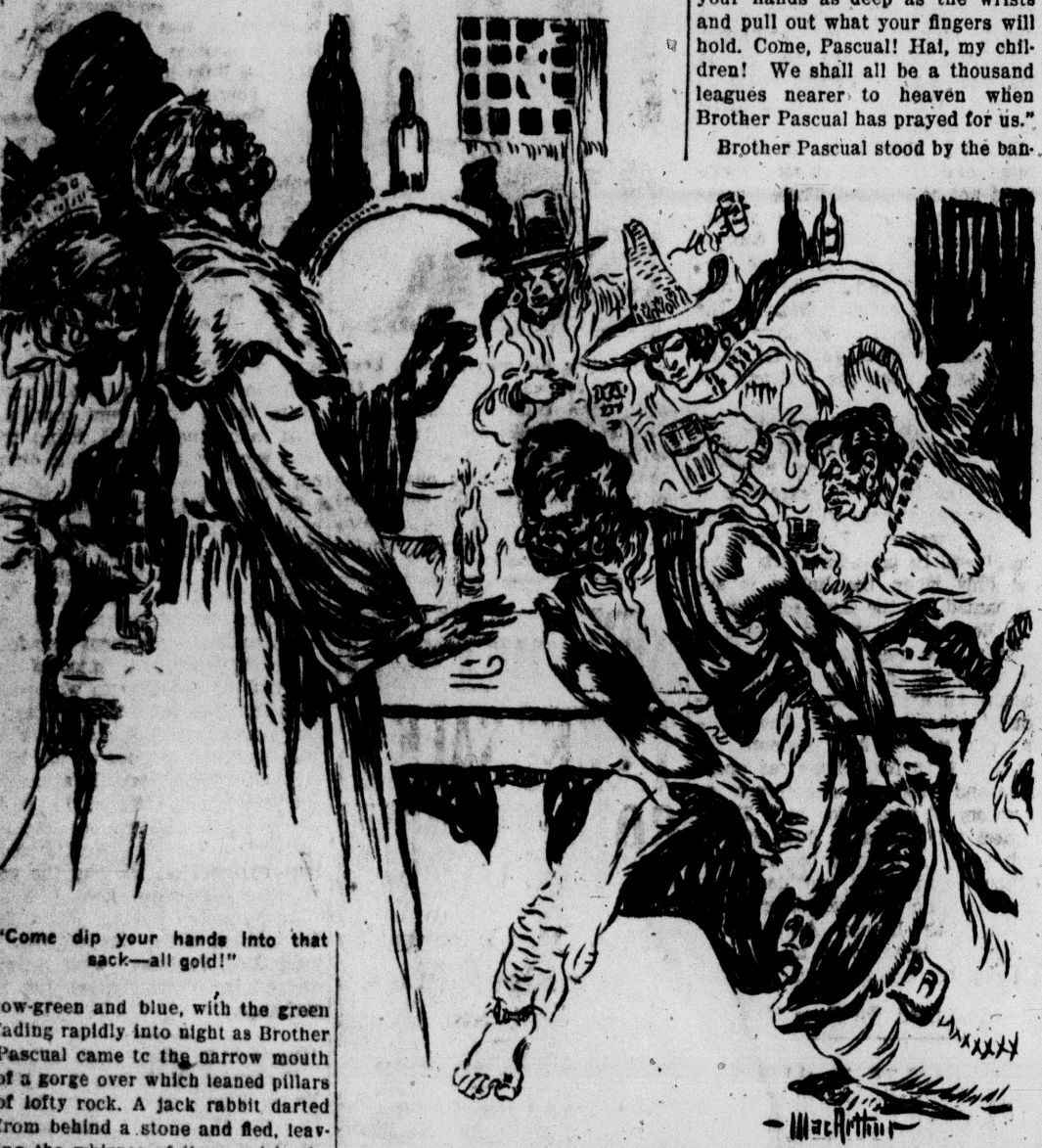
"Come dip your hands into that sack—all gold!"

The chief criticism of the Federal housing program seems to be that there's been too much delay in getting things started. When FHA was created in the closing days of the last session the claims was made on all sides that it was the agency which really would bring recovery.