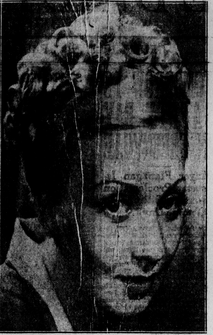
Ann Sothern, blonde film beauty, shows a new type of hairdress in which tousled curls are piled high above a straight band of hair across the forehead. The ear ornament gives a shooting star effect, with sprays of diamonds.

ration day, also is credited with keeping in close touch with Palo Alto. If so, he never hints at what is