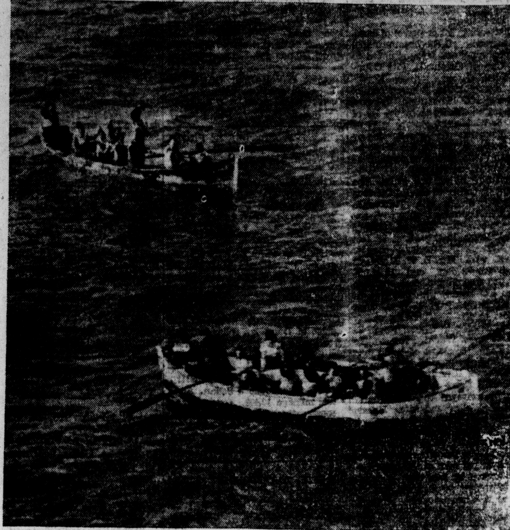
Passengers who deserted the Ward liner "Havana" after it went aground off the Florida east coast are shown here bobbing about in lifeboats on a rough sea before being rescued by the tanker "El Ocaño" and brought to Miami.