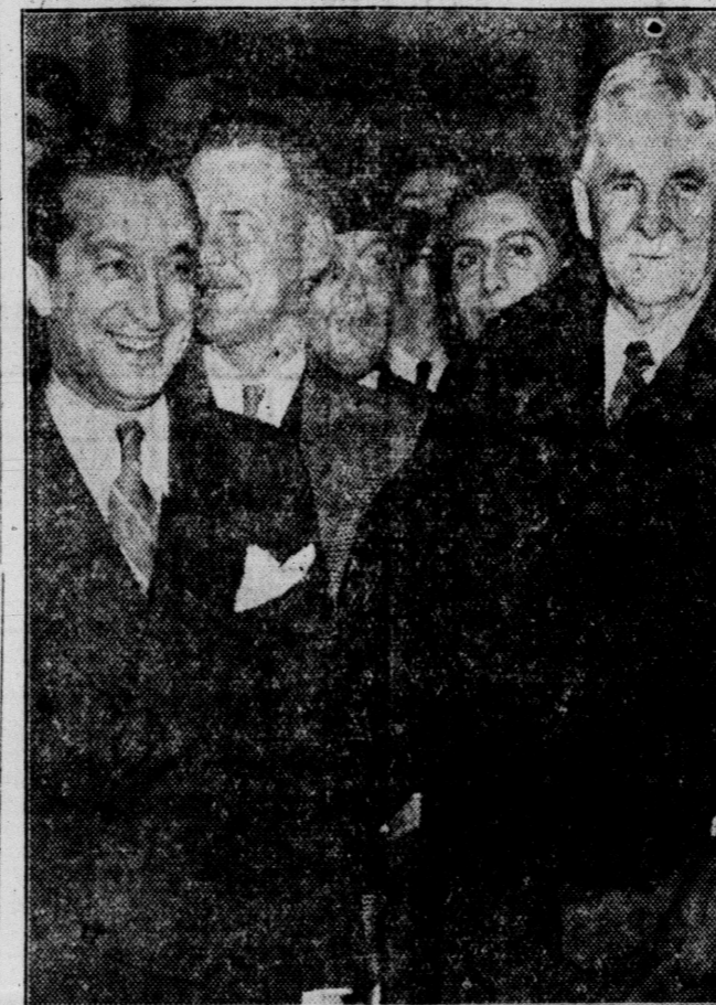
Taking the witness stand in the trial of Bruno R. Hauptmann, accused kidnap-murderer of Charles A. Lindbergh, Jr., Dr. John F. "Jafsie" Condon identified the defendant as the "John" to whom he paid $50,000 futile ransom for the slain infant. Condon's appearance as a witness aroused tremendous interest among the spectators. Here he is shown at right with Attorney General David T. Wilentz, who leads the prosecution.