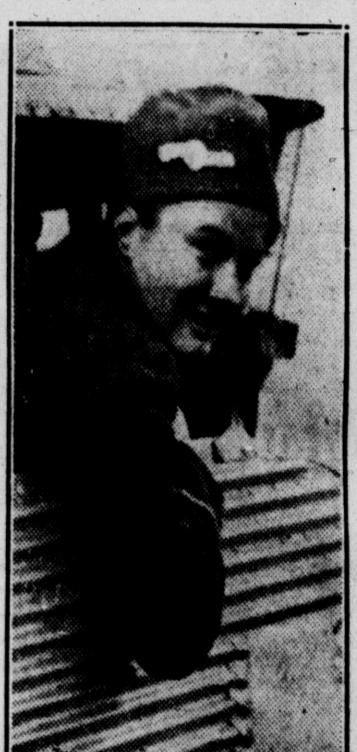
Miss Helen Richey, the first woman to hold a regular job as co-pilot for a commercial airline carrying mail and passengers, is shown as she prepared to take off from Washington, D. C.