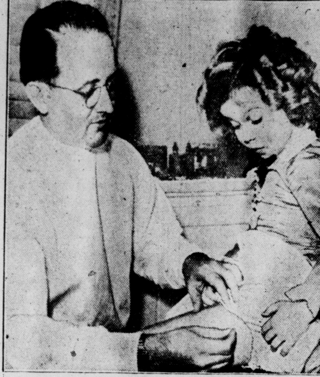
It was something of an ordeal for her parents, but Shirley Temple of the movies didn't seem to mind when she was vaccinated against smallpox.