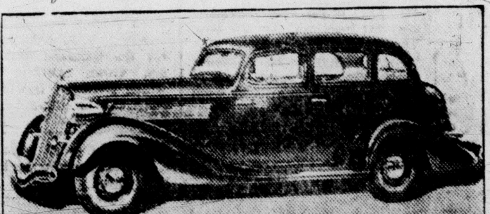
Hudson Eight Cylinder Sedan mounted on 117" wheelbase with 113-horsepower engine. This is a full six-passenger capacity car with modern ventilating system and welded all-steel roof.