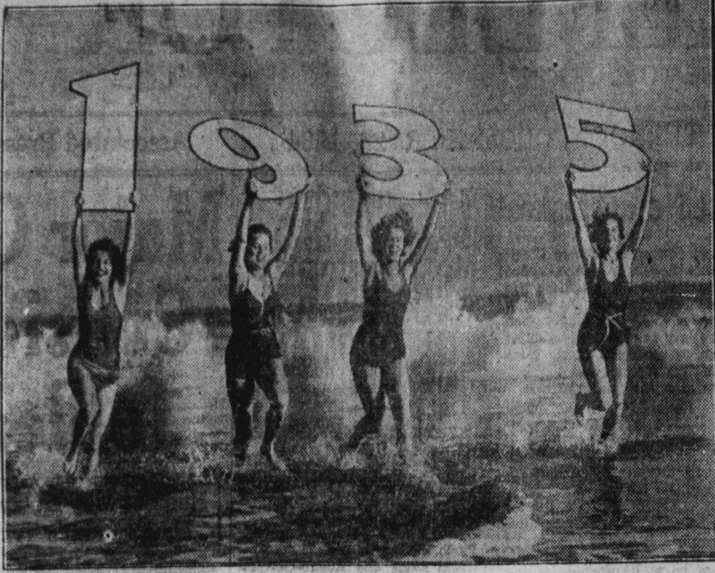
These pretty mermaids at Long Beach, Cal., have a few new ideas about how the New Year should be welcomed. They will take part in that city's marine celebration of the New Year.