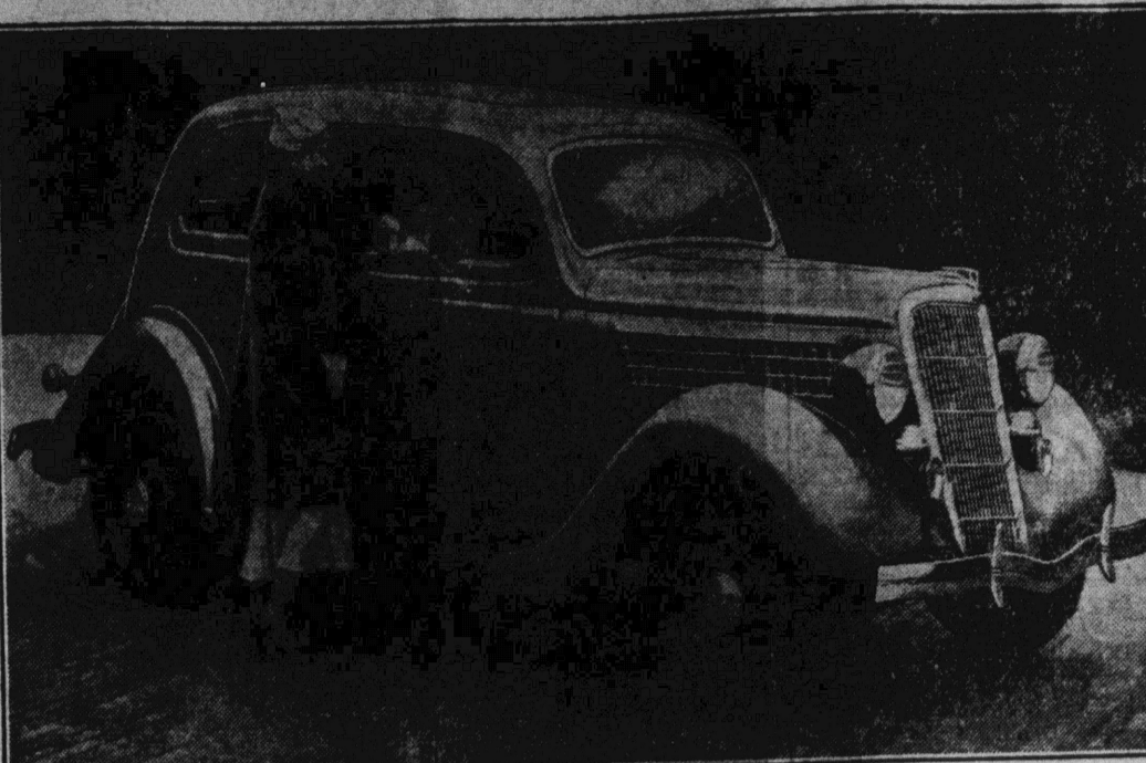
PHOTO shows the new Ford V-8 de luxe Tudor sedan for 1935, which has just been announced. The body lines are distinctively modern and a departure from previous Ford standards.

The cars feature many engineering improvements providing greater riding comfort and increased ease of control. The engine has been moved forward. Passengers ride closer to the center of the car. The Ford V-8 engine now has a new system of crankcase ventilation. The Tudor sedan is also available without de luxe equipment.