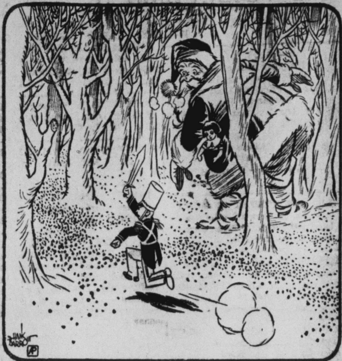
The captain of the tin soldiers was very brave. He rushed out waving his sword.

SYNOPSIS: The fairies make Dagmar, a little doll, just for Santa Claus. He is pleased, but not for long, because he discovers that his holly tree forest is dropping all the red berries, and he will have no Christmas wreaths. CHAPTER II Work in the Toyshop Santa was horror-stricken when he saw the pretty, red berries fall-