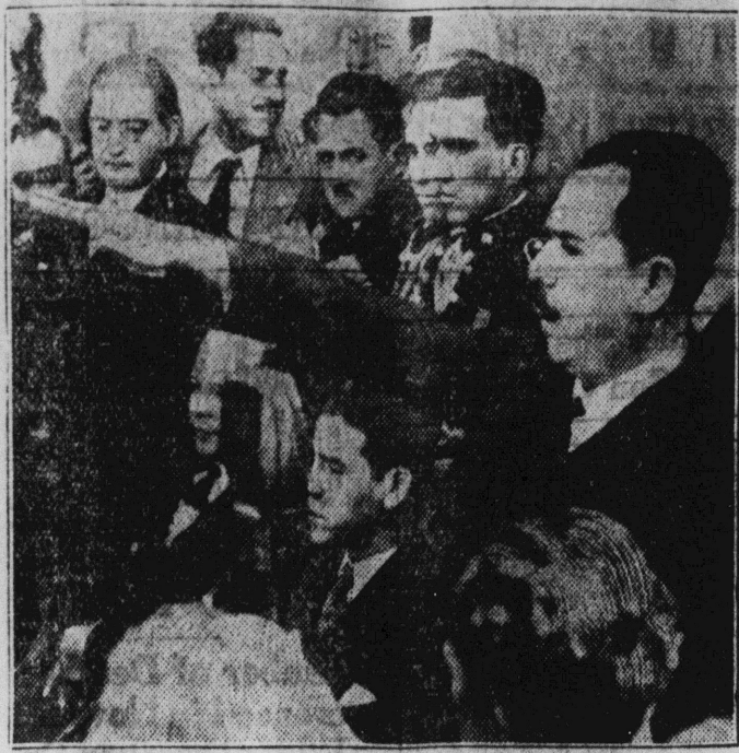
Gen. Lazaro Cardenas, at 39 the youngest constitutional president ever to rule Mexico, is shown with outstretched arm as he took his oath of office in Mexico City. He is surrounded by high officials of the Mexican government and members of the diplomatic corps.