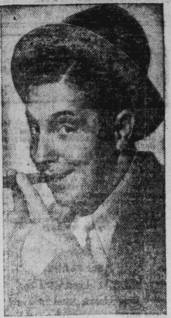
Goo-Goo, it's Joe Penner coming Monday and Tuesday in "College Rhythm," a musical of campus cuties, co-eds, comics, music and everything.