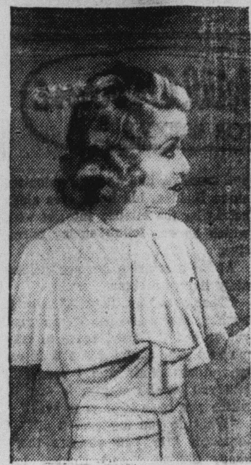
Corstance Bennett who comes to the State Thursday in the screen play "Outcast Lady." Hugh Williams and Herbert Marshall are featured with her.

Red Oak Club Entertains. The Red Oak Home Demonstration Club held their annual social meeting last Wednesday night at the Greenville Woman's Club. A