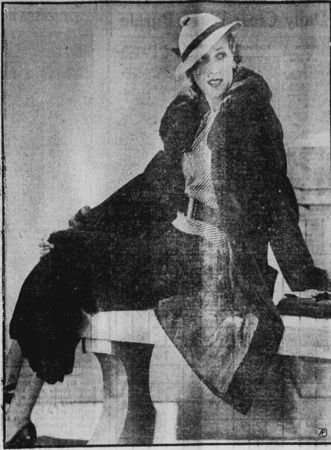
Fashion is using new and less expensive furs to accent many winter costumes. The three-quarter-length coat of this henna wool ensemble is lined with hamster (rat dyed soft brown), while the collar is fashioned of beaver. The blouse is of henna and beige-striped wool, the slouch hat of beige felt finished with a brown ribbon. Design by Philippe et Gaston.