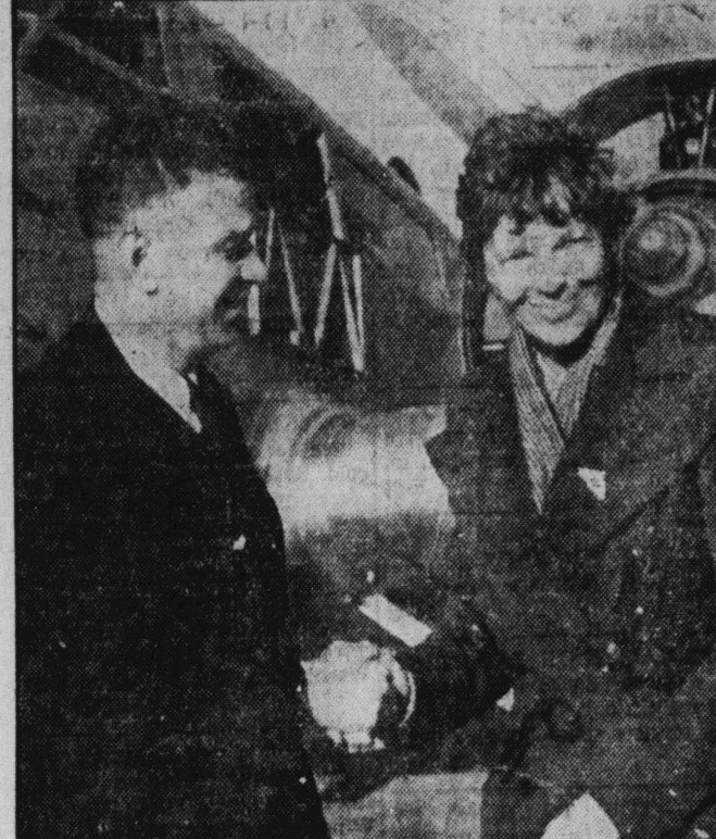
Here is one of the last pictures made of Flight Lieutenant C. T. P. Ulm, who with two companions, was forced down in the Pacific near Hawaii on an attempted flight from California to Australia. Amelia Earhart Putnam, noted flier who herself spanned the Atlantic, is shown bidding Ulm goodbye in front of his plane, "Star of Australia," just before the takeoff. A wide search by sea and air was underway for the three airmen.

be able to draw no better than half that many because of the limited seating capacity of the Baltimore stadium.