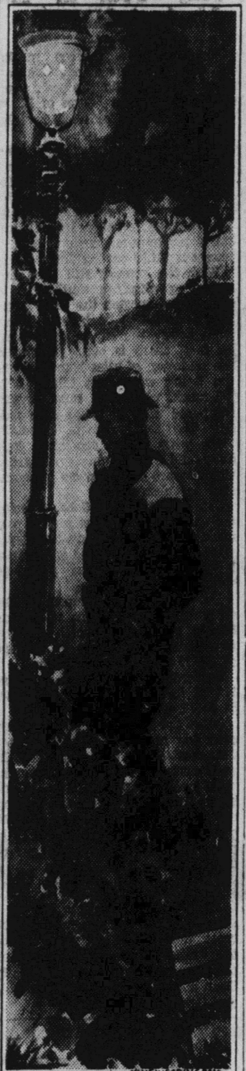
I strolled home through Regent's park.

Society, with a big S, chose to slam its doors in my face, I could derive such consolation as I needed by throwing myself all the more wholeheartedly into my work. Who could tell? Perhaps one day I might even come to look back on my present troubles as a blessing in disguise. Fortified by this sudden and optimistic reflection, I emerged into the light and bustle of the main road. My studio was at the end of a narrow cul-de-sac, turning off to the left, about two hundred yards up Haverstock Hill. It was one of a pair, shut in behind a high wooden fence, and as the other had been empty ever since I had taken possession, the quietness and privacy of the situation could scarcely have been improved upon. I had covered about half the distance and was just passing under a street lamp, when a hoarse voice from the roadway brought me to a standstill. (Copyright, 1934, Penn Publishing Co.) Nicholas receives, tomorrow, a pair of messages, one of them puzzling.