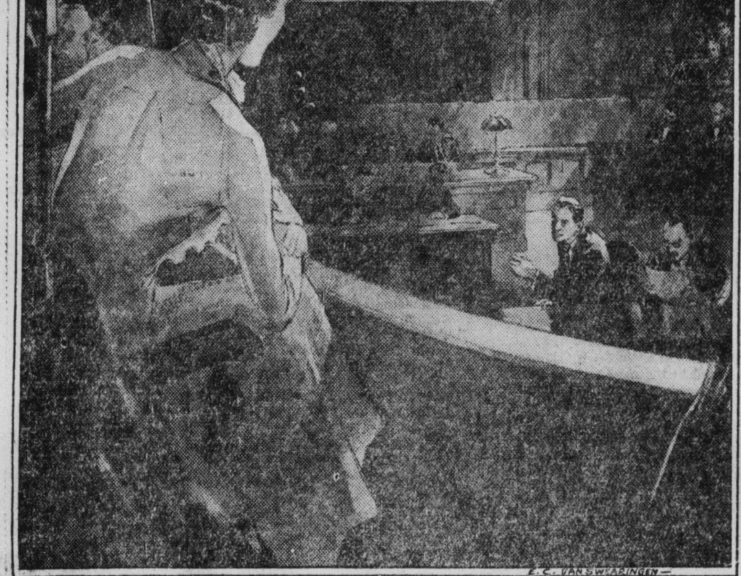
I hadn't the remotest idea who she was.

"The prisoner," he said, "is discharged."