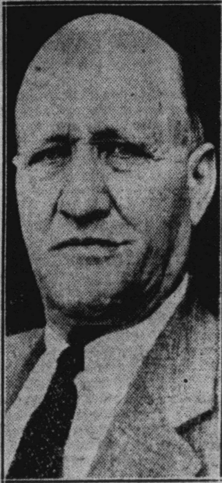
Gov. B. B. McMur of Arizona sent national guards to a desolate uninhabited patch of land on the Colorado river to prevent construction of the Parker version dam across the str.