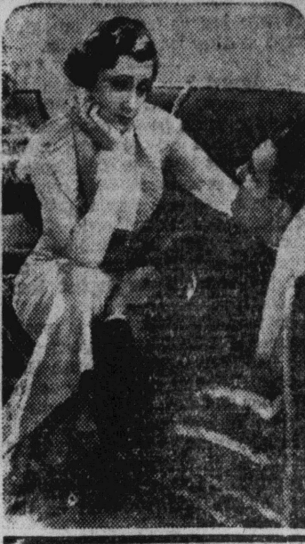
Irene Dunn in scene from picture "This Man Is Mine," State today.