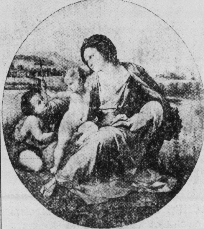
A dispatch to a Paris newspaper said Andrew Mellon has paid the Soviet government $1,500,000 for Rafaela "Alba Madonna," of which the above is a reproduction. It was painted in Rome some time after 1503.