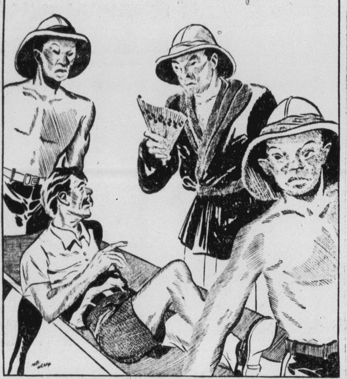
"You will hold the ship for Bowers," ordered McLeod.

His eyes, lazy with morphine, roved until they were focused on the placid face of Wong Bo. By eye