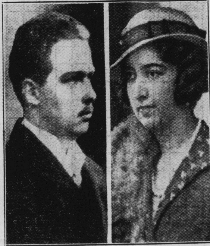
The departure of the Archduke Otto, pretender to the Austrian throne, from Brussels for Italy, strengthened rumors in Europe that efforts were being made to arrange his marriage to Princess Maria, 19-year-old daughter of King Victor Emmanuel. Should the monarchy be restored in Austria, Otto's position as a suitor for Maria's hand would be strengthened. The two are shown above in recent pictures.