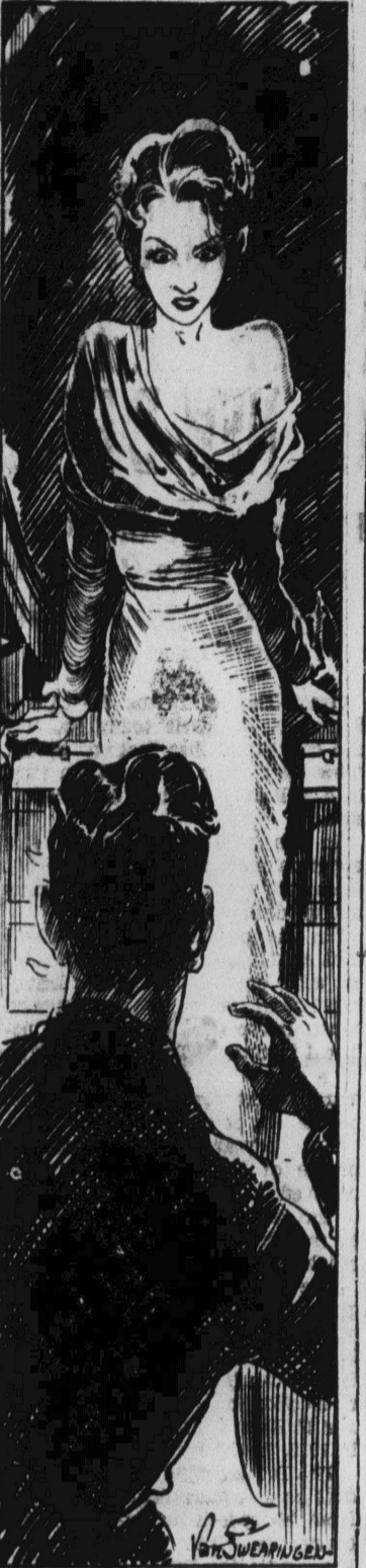
Marsha's eyes were fixed on his.

cern he had felt for her was swallowed by rage; what was she doing to his mother, whom she had pretended to love? He saw her, back toward him; her abundant, curling hair around her shoulders. Her negligee had slipped to leave one shoulder bare; he saw the whiteness of her skin outlined by undulating strands of black. He saw her shiver as he began to smile bitterly. "What are you doing?" he flung at her loudly. She turned with a start of faint panic; the knife she