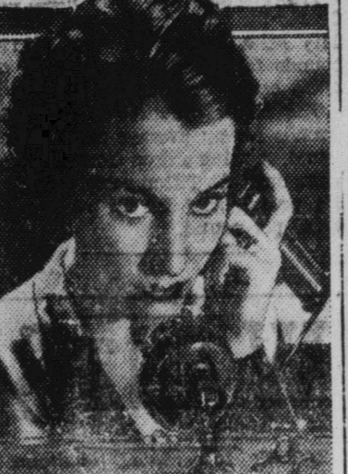
Constance Cummings in "Looking For Trouble"