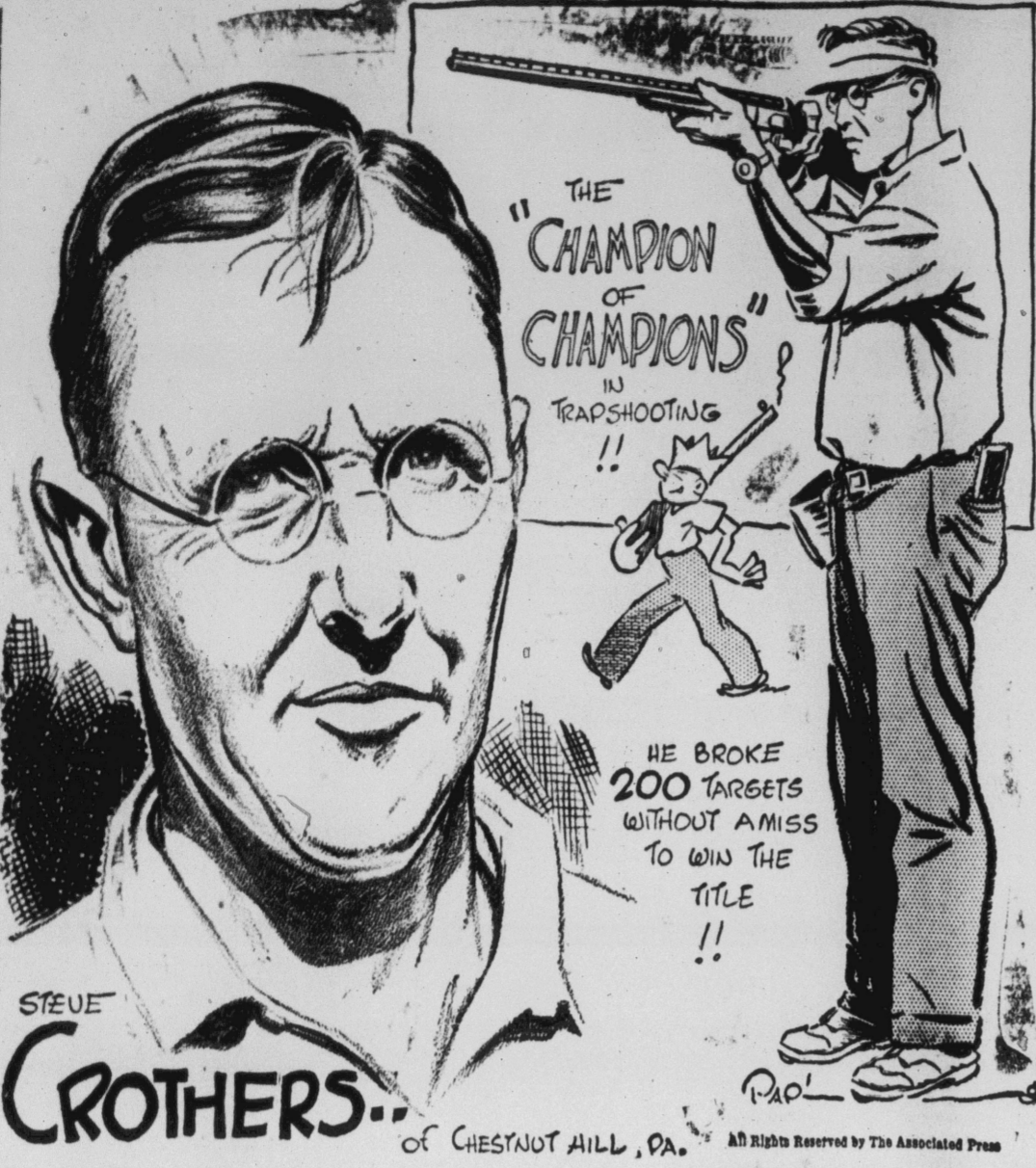
glory that might have been his.