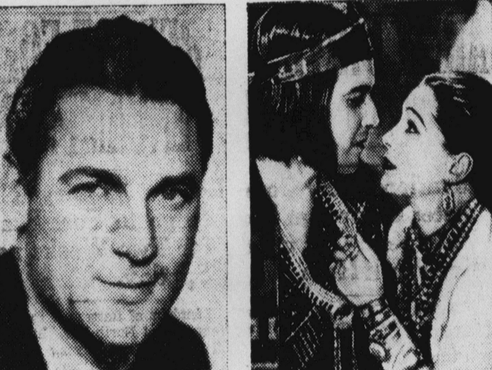
James Dunn featured in "Change of Heart," film starring Charles Farrell and Janet Gaynor at State Theatre Monday and Tuesday. Ramon Navarro is starred with Lupe Velez in "Laughing Boy" story of primitive love from Pulitzer prize novel, Wednesday.

top of the case at all times. A former criminal prosecutor himself, he was able to supply the Federal agents with innumerable bits of advice. Time after time Hoover was summoned to the A. G.'s office for conference on Dillinger.