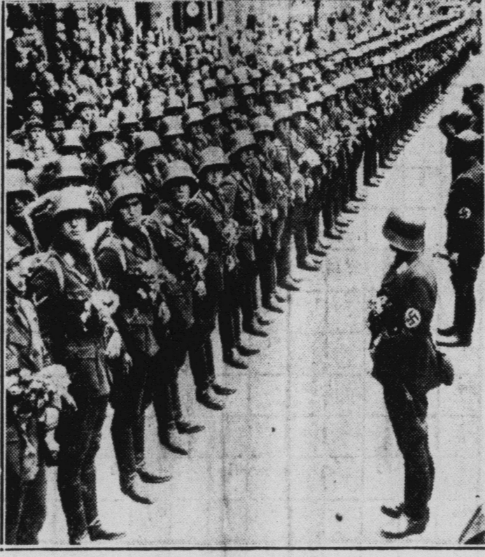
The Austrian political situation, seething with unrest since the socialist uprising the first of the year, received another staggering blow when a band of 144 Austrian nazis raided the federal chancellery at Vienna and killed Chancellor Dollfuss. A group of Austrian nazis are pictured above as they visited Berlin recently when they were honored by the Hitler government.