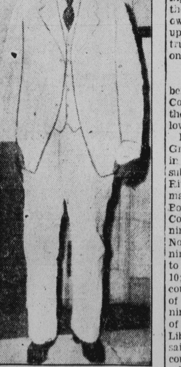
President Carlos Mendieta of Cuba is shown with his left hand bandaged as a consequence of a wound inflicted by a bomb that exploded during a luncheon at Tiaricornia, just across the harbor from Havana. Two men were killed and ten were wounded besides the president.