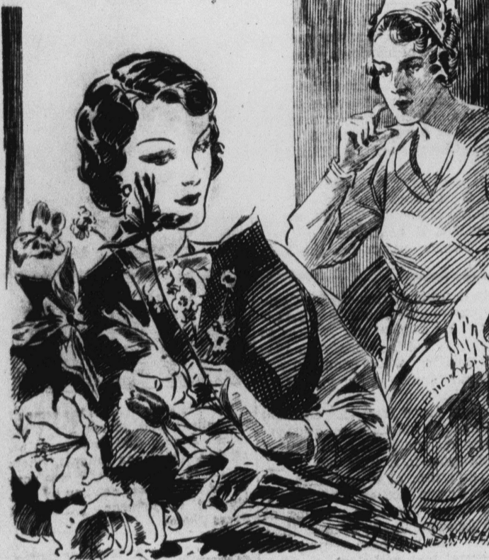
They were Bob's flowers.

Then he had gone on to tell her that sometimes for months they saw no women save a few old crones who did their laundry by beating it to nothing on the stones at some turbulent river's edge.