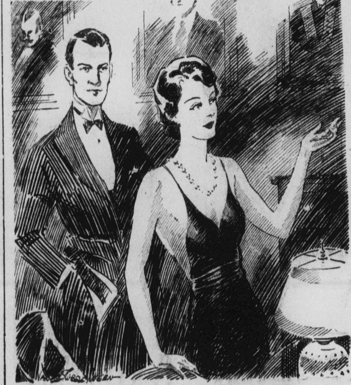
"Can you see them as my ancestors?" asked Marsha.

"I AM going to a committee meeting," said Miss Gertrude; "we are to discuss plans for the Community House—"