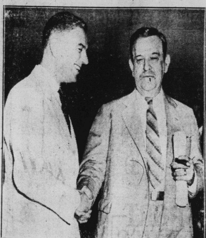
Prof. Rexford G. Tugwell (left) is shown greeting Senator Ellison D. Smith of South Carolina at the senate agricultural committee's inquiry into his fitness to hold the new post of undersecretary of agriculture. During the examination which lasted four hours Tugwell denied there was a "brain trust," and said he opposed "national planning" of the soviet sort. Smith was one of those opposing Tugwell's elevation to the $10,000 a year job.