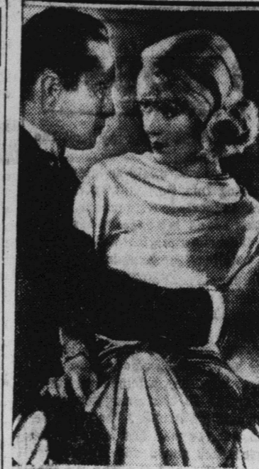
Constance Bennett and Franchot Tone at the State Thursday in musical romance "Moulin Rouge."

LAUNDERING DRY CLEANING - PRESSING Crystal Laundry PHONE 30