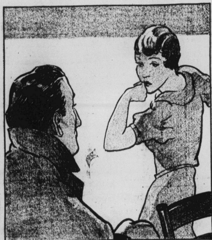
"Don't take me back to that house," she pleaded.

SYNOPSIS: At last there is a bit in the wall of silence that has surrounded Sergeant Harper's investigation of the murder of the politician and the policeman in Pierre Dufresne's house. Ellen Becker, formerly a housemaid for the Dufresnes, has admitted receiving money from both Mr. and Mrs. Dufresne to keep quiet about some bad found concealed in the house. Harper accuses her of working with Dougherty, the chauffeur. Chapter 43 THE AUSTERLITZ "WE HAVE not, I've told you everything I know about it. Joe and I have been going around together and he worships the truth out of me about why I left. But if he's been getting any money out of it, I don't know anything about it. Don't take me back to that house," she pleaded. "Honestly, I've told you all I know." "You'll have to face the music," Harper declared, "but for the present I'm going to hold you in reserve as a surprise witness. You'll have to stay in this house, though, until I'm ready, and there will be a detective right here to see that you don't run away. You will not be allowed to send any messages before morning." "I'll stay here and the longer the better." So it was settled. Detective Harris was given his instructions and