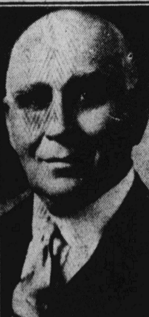
Lieut. Gov. Frank F. Merriam (above) succeeds the late James Rolph, Jr., as governor of California.