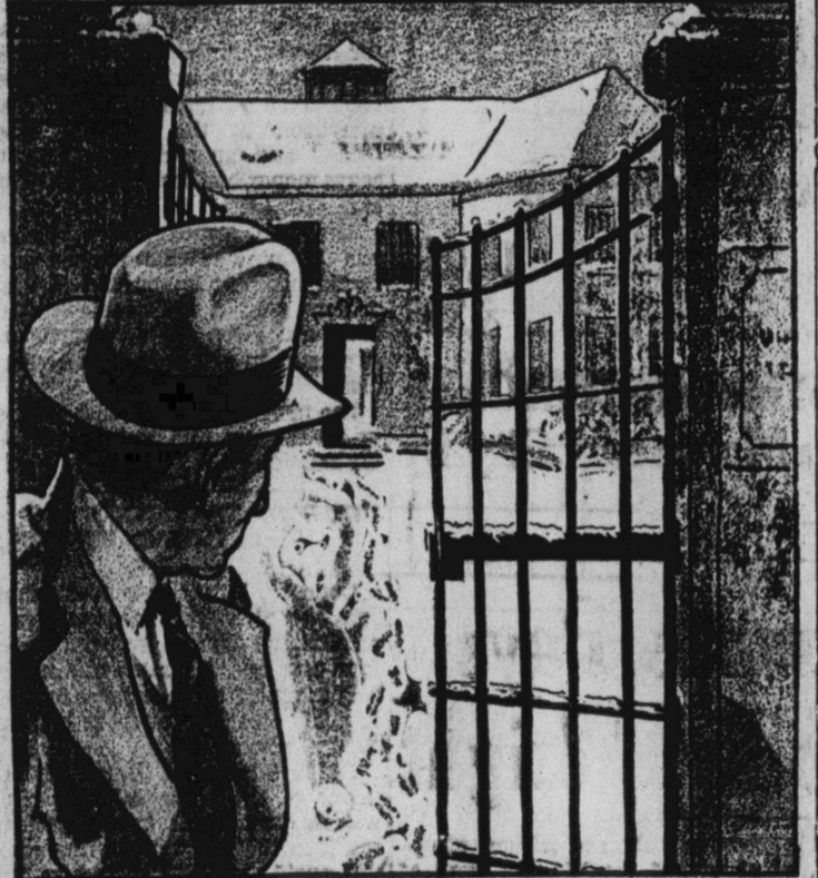
The door was supposed to draw attention.

Chapter 34 BANGING DOOR... "NEXT, the murderer rinsed and dried the second liquor glass and put it back in the cabinet," explained Harper. "The dead man's pockets and clothing were emptied of anything that might establish his identity. But the killer over-reached himself there by making too thorough a job of that. A couple of keys, a pen or pencil, two or three things like that would have created a more normal appearance. By means unknown to us, the murderer then made his escape."