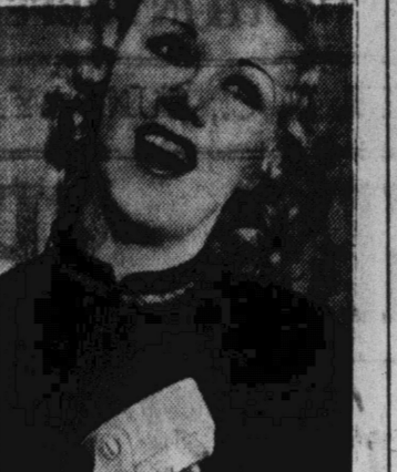
Blonde, vivacious star of "Twenty Million Sweethearts" at the State Monday and Tuesday.

lally it will find its way to the nail boxes of his constituents some 2,000 miles away. Rarely is objection raised in such cases. Once a member is lucky enough to get time on the floor to make a speech, there's a sort of gentlemen's agreement that his subject matter may be to his own choosing.