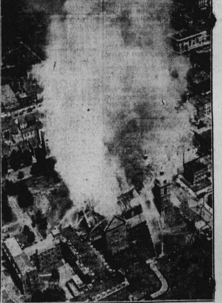
The old church at St. Michael's Monastery, Union City, N. J., which is noted for its collection of religious art treasures, was wrecked by fire. The loss was estimated at $500,000, but many of the church's most valued possessions, including a blessed sacrament and a relic of the true cross, were saved.