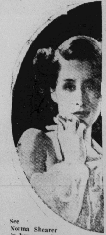
See Norma Shearer in her new picture "Riptide" at the State Theatre Monday-Tues.