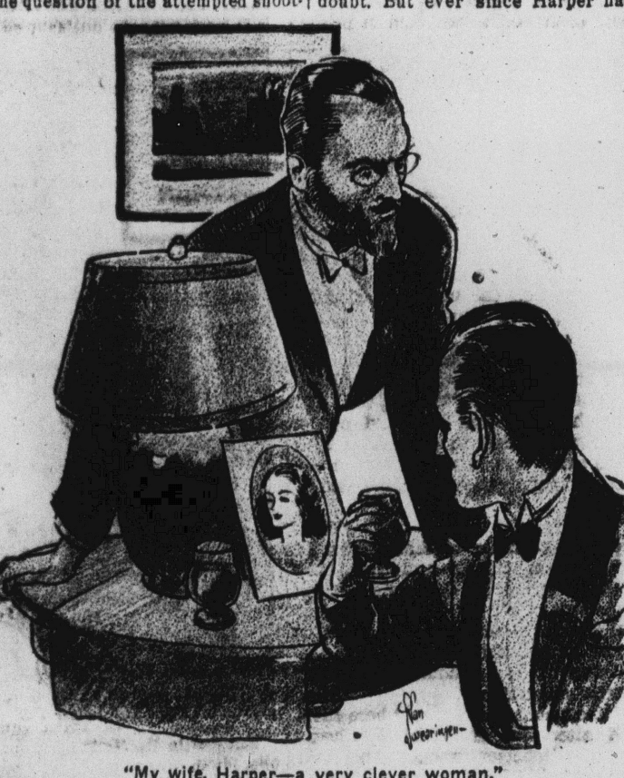
"My wife, Harper—a very clever woman."

Chapter Four DINNER FOR TWO "ANDREWS, we'll have the coffee and brandy in the living-room." Pierre Dufresne turned to his guest, who had caught that faint pucker of disapproval on the butler's mask-like face. "If you are ready, Harper—" Detective-Sergeant Stephen Harper rose, following his host's example. The gray-haired servant was speaking. "Mr. Harris brought those papers from the office, sir, but the police made him wait outside." "Your men take their orders very literally, Sergeant," said Dufresne, smiling. Then, to the waiting Andrews, "Bring me the papers." The dinner itself had been excellent, each succeeding course testifying anew to the soundness of the host's choice. All during the meal Dufresne had deftly ignored the object of Harper's visit. Time and again the detective had brought up the question of the attempted shoot-