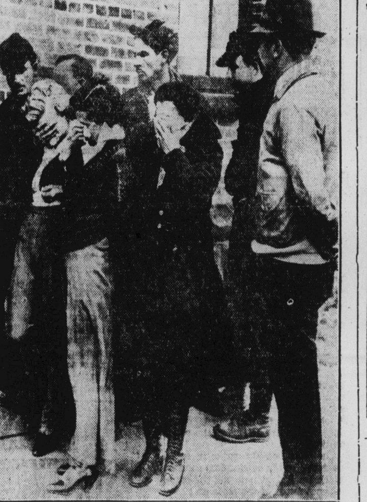
These three women were arrested by federal agents who routed John Dillinger's gang from the Little Bohemia resort near Mercer, Wis. They are being held at Madison, Wis., and officers are seeking to obtain from them a clew that will be of value in tracking down the elusive outlaw.