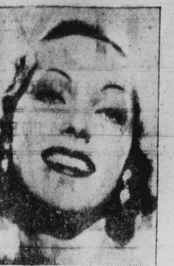
Adrienne Ames has a featured role with Rudy Vallee, Jimmy Durante and Alice Faye in the Fox Film presentation of George White's "Scandals."

Moose Die On Island Duluth, Minn. — (AP)—The Michigan conservation commission is planning to study deaths of moose on Isle Royale in Lake Superior. Fishermen say several moose of the 800 that have died during the past winter and it is feared some malady may be responsible. Scientists have estimated the earth's age to be three billion years.