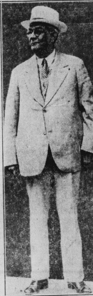
Officials of the Cuban state department said they would request the extradition of Gerardo Machado, deposed president of Cuba, to face murder charges. He has been living in New York.