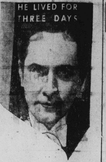
Frederic March as he appears in scene from picture "Death Takes a Holiday" coming to the State Wednesday.