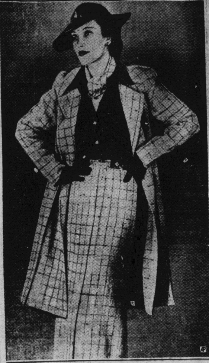
A Black linen shirt, black patent leather hat and belt and black suede gloves give the 1934 touch to this spring suit of beige wool flecked with black. Marcel Rochas designs it with the trimly tailored, though feminine, lines in vogue this season. The coat is three-quarter length.

By RITA FERRIS (Associated Press Fashion Editor) Paris, April 17.—(AP)—Femininity is the essence of that new spring suit.