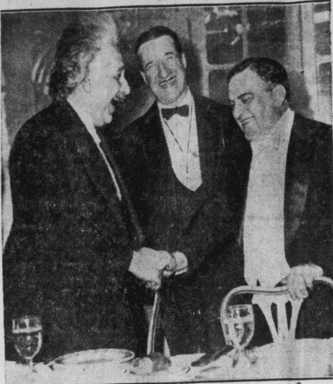
Prof. Albert Einstein (left), usually of serious demeanor, had a good laugh when he attended a testimonial dinner in New York in honor of Rabbi Stephen Wise (center), who with Mayor Fiorello LaGuardia, found the situation equally amusing.