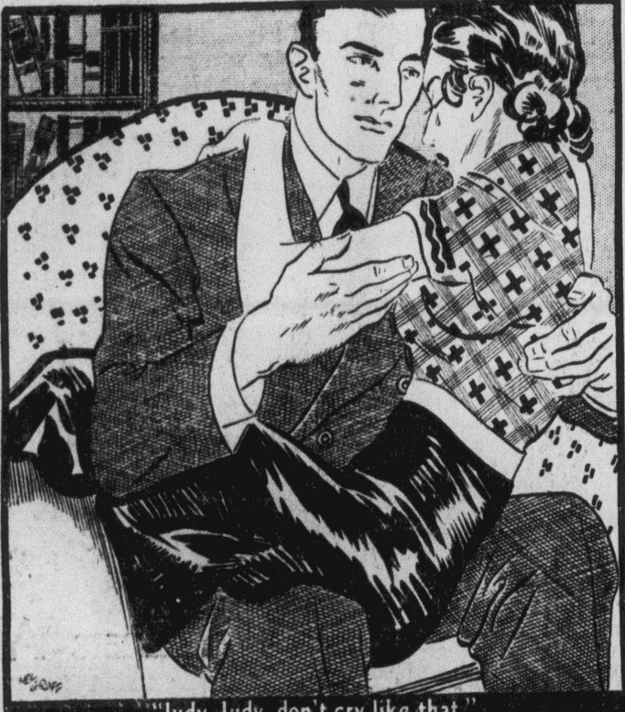
"Judy, Judy, don't cry like that."