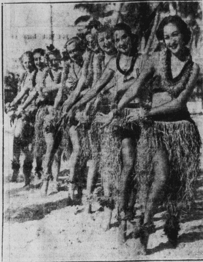
Fascinating Hawaiian rhythms are echoing on the Florida beaches this season. American girls are being taught the intricate technique of the tropical island art by two Hawaiian princesses. The above Miami beauties, members of one of the classes, seem to have learned their lessons well.