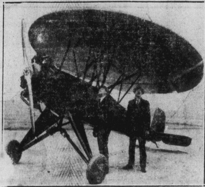
Odd plane with a round disc for wings was hailed by inventors forward in the hunt for a plane that will land in limited space. It is designed to go 135 miles an hour and to land at a 60-degree angle in a 25-foot circle. Picture was made when the ship was being tested in Chicago.