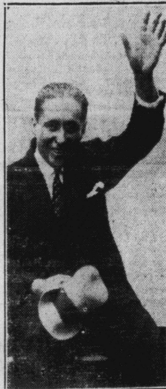
Dieudonne Coste, noted French ocean flier, was reported missing on a flight over the North Sea from Paris to Copenhagen.