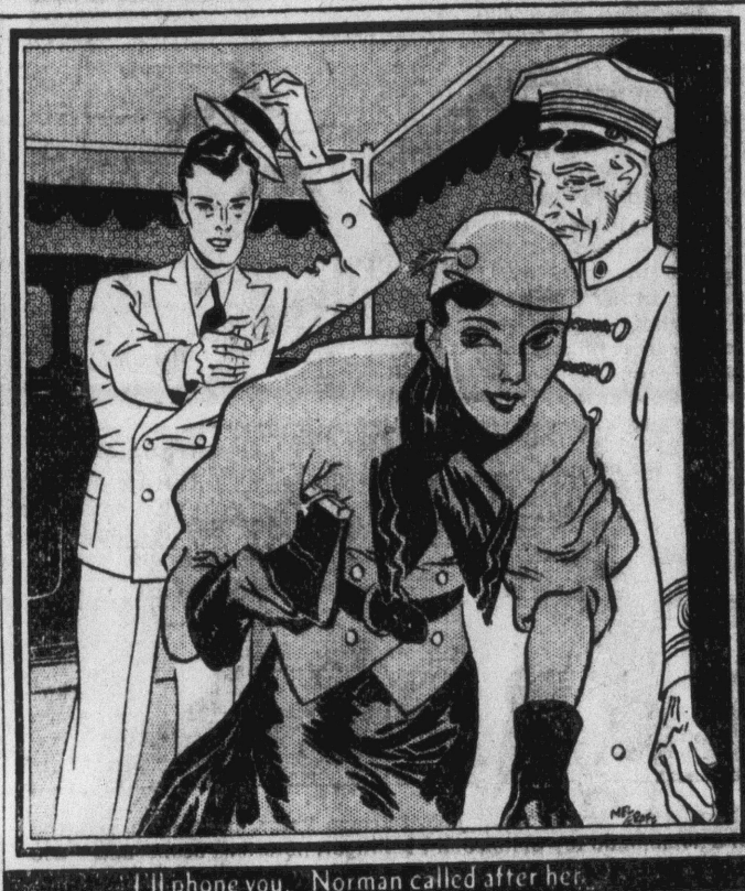
"I'll phone you," Norman called after her.

The moon-faced clock brought Judith to the realization she was due to meet Gloria in five minutes.