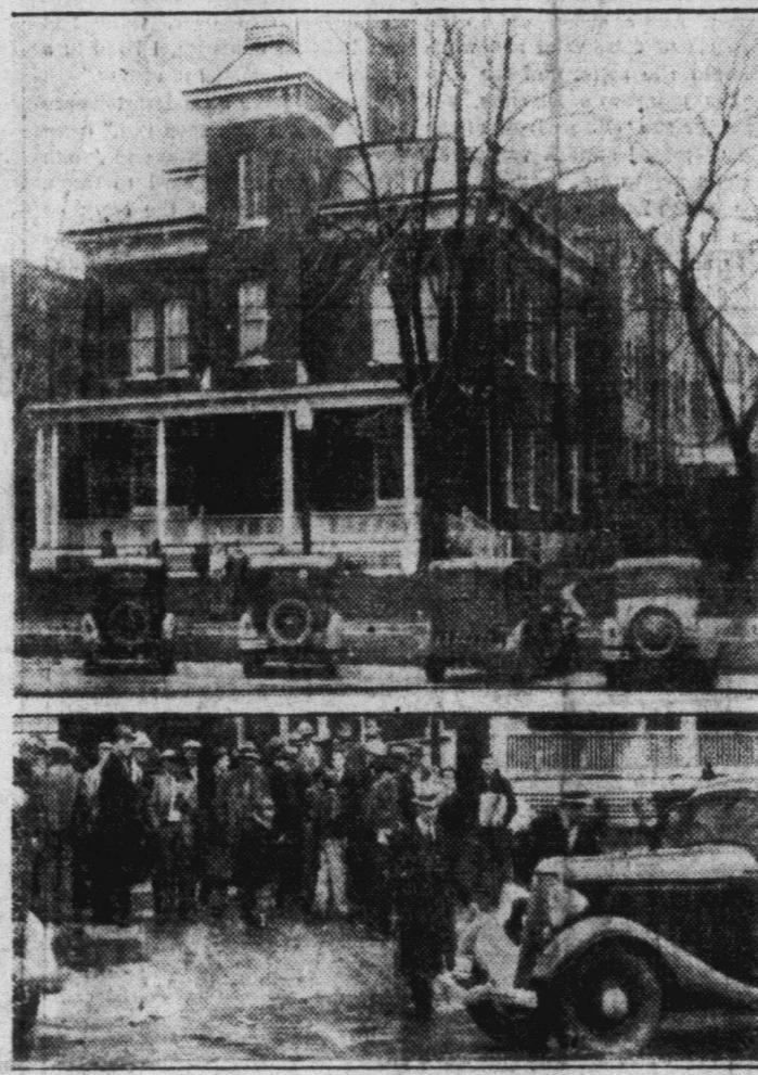
Above is the "break-proof" jail at Crown Point, Ind., where, with the aid of a homemade toy pistol, John Dillinger, notorious desperado, made good his escape despite extra precautions to guard him. Below a crowd is shown in front of the jail as a posse left in pursuit.