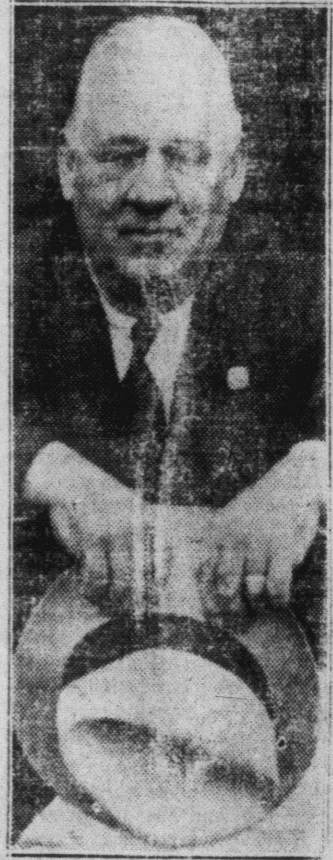
John J. McGraw, "Little Napoleon" of baseball and pilot of the New York Giants, died yesterday at a New Rochelle, New York, hospital, following an illness of ten days.