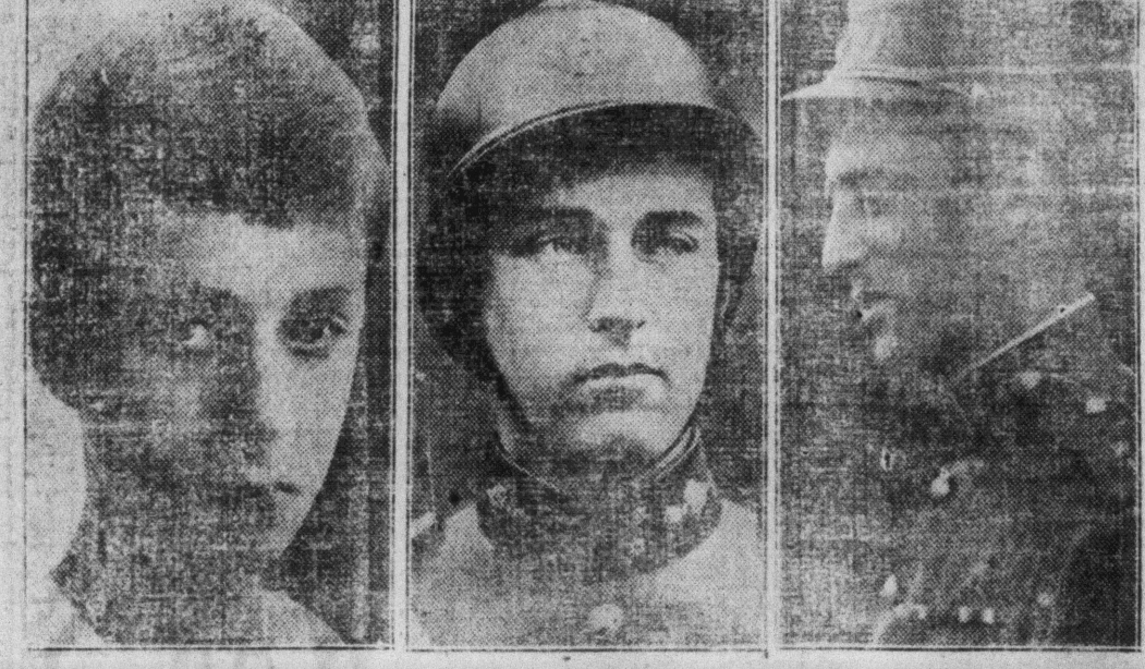
Here are three camera studies of Leopold III, who was called by tragedy to the throne of Belgium. At left he is shown as a young boy. In the center he is pictured in a captain's uniform during the days of the world war. At that time he endeared himself to his countrymen by enlisting as a common soldier at the age of 13. At right is a recent picture of the crown prince, who at the age of 32 takes his place among the crowned heads of Europe.