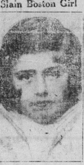
Slain Boston Girl

Several Actions Completed in Yesterday's Session of Superior Court Actual disposition of one divorce case and compromise in several other actions marked yesterday's session of the one week civil term of Superior court which convened here Monday morning.