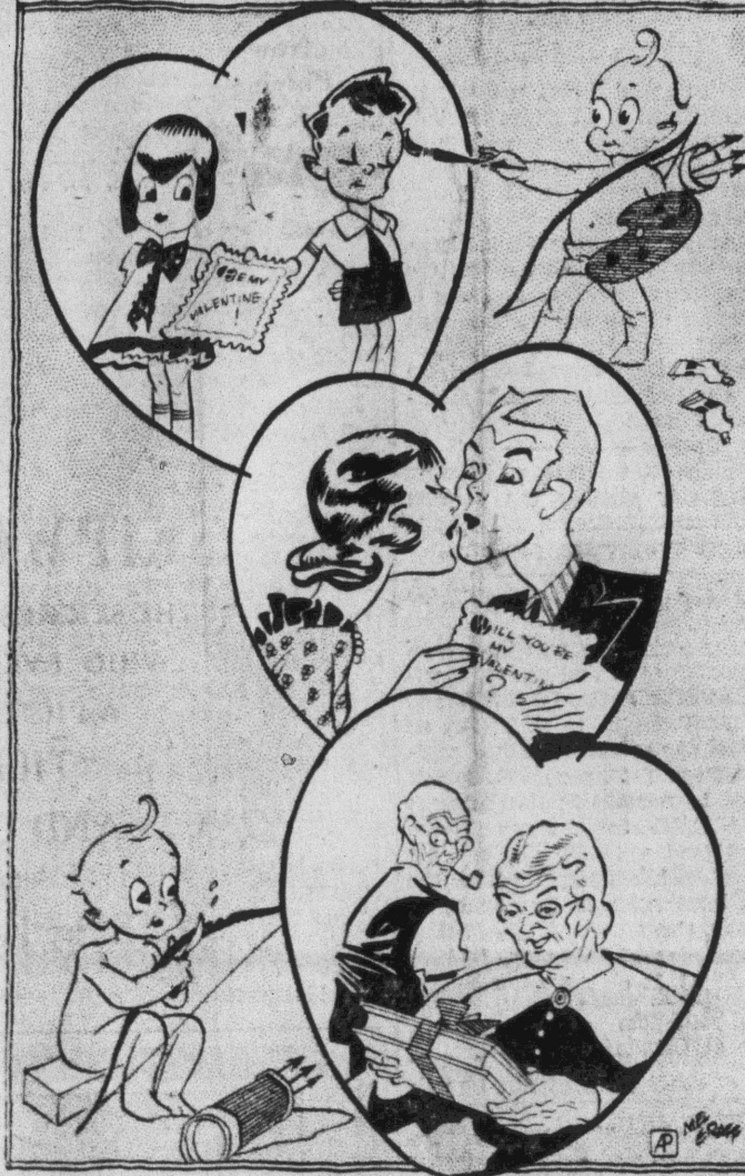
Young or old, if your heart's in the right place, this is your day as well as St. Valentine's.