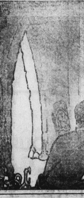
First, they must have food and rest.

"CAN'T tell how many of these people are about," Frank went on. "Come, we have just enough time to get into the jungle before daylight."