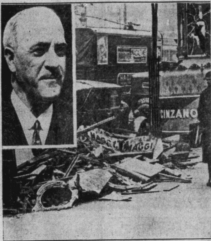
Violence and rioting that has swirled around Paris in recent weeks assumed serious proportions as Premier Edouard Daladier (right) battled for the life of his government. Fearing other disorders troops armed with machine guns were mobilized in the capital and thousands of police were massed in the neighborhood of Elysee palace. The dismissal of Jean Chiappe (inset), Paris police prefect, aroused considerable agitation, chiefly among war veterans. Pictured above is debris left in the wake of recent rioting between royalists and police on a prominent Paris thoroughfare.