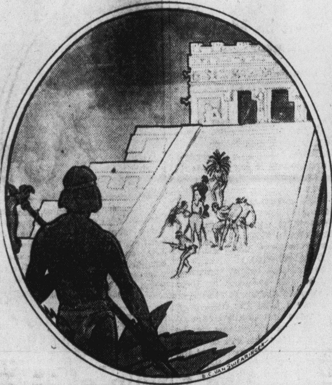
Grahame adjusted the powerful lenses.

ABRUPTLY they separated. Raising his binoculars Grahame saw, descending from the house atop the pyramid, a tall figure, clad in sandals and breech-clout. The head