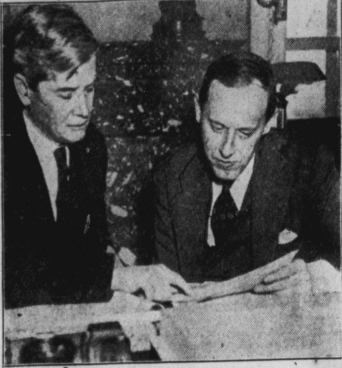
Chairman James P. Buchanan (left) of the house appropriations committee called Harry L. Hopkins, federal relief and civil works administrator, before the committee to get information regarding relief needs. Hopkins asked for quick action on the $950,000,000 appropriation funds for continuing the work of his organization. He said available funds for civil works would be exhausted between February 10 and 15.