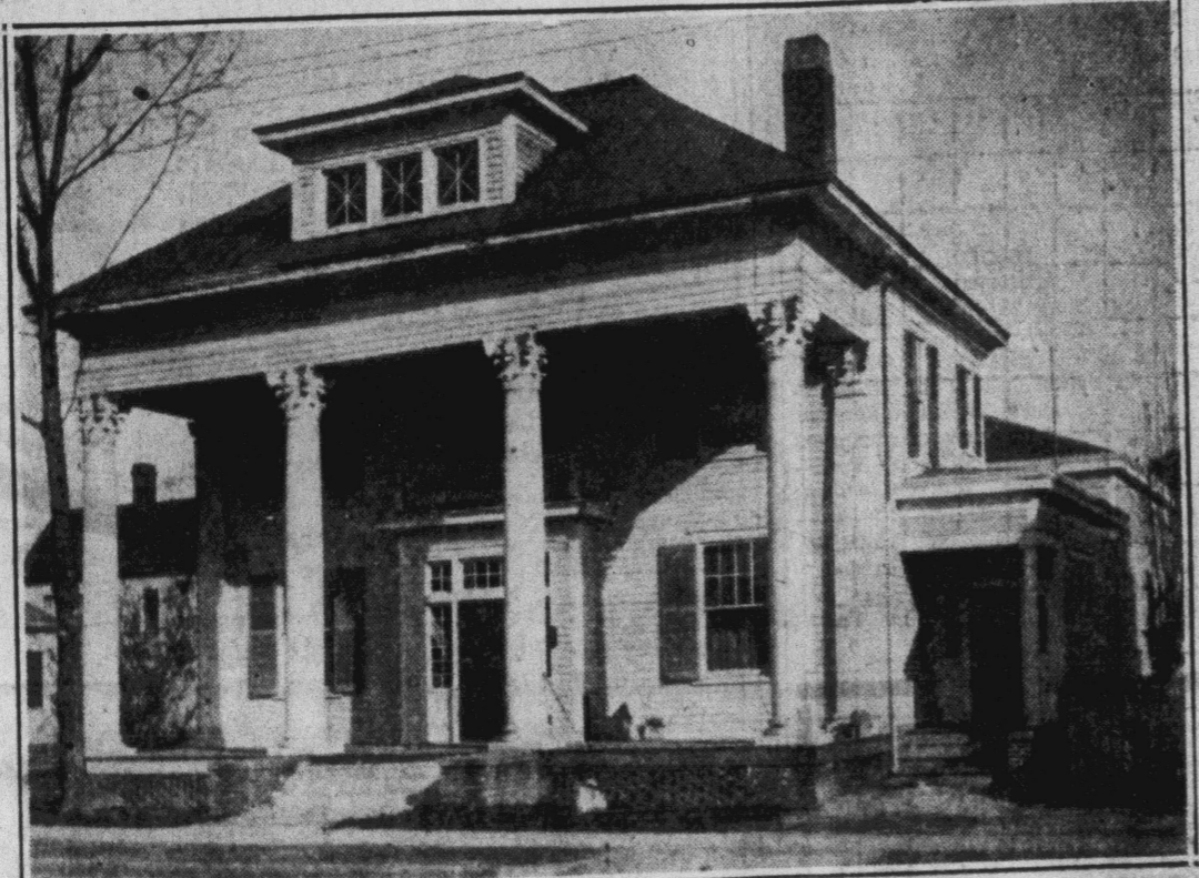
Local business men will come to the financial aid of the Greenville woman's Club in order that the club might save its beautiful home, pictured above. Since this building was bought by the club several years ago it has become a community center for the city and county. A group of business men last night pledged $1,000 to apply on the debts against the building and agreed to help raise a fund sufficient to reduce the indebtedness to a figure that would permit the club to carry on.