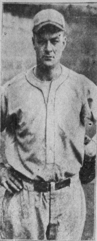
Catcher Jimmy Wilson (above), ex-St. Louis Cardinal, now has a task on his hands. Appointed manager of the Philadelphia National league club to succeed Burt Shotton, he will attempt to elevate the lowly Phillies.

to the picture of Jones, like the old warrior, sensing the thrill of golfing battle again. He had all of it he wanted in some fifteen years of national tournament competition from 1916 to 1930. He put over the celebrated grand slam in his final and cried "enough!" He meant it.