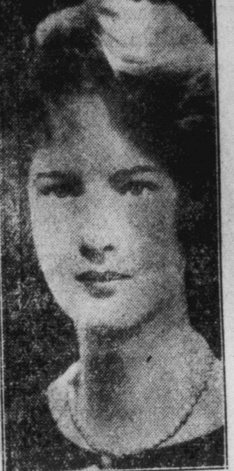
The Duke of Westminster, reputedly one of the wealthiest men in Great Britain, issued a writ claiming damages for alleged libel against his niece, Lady Sibell Lygon, 26. The controversy centers about a recent magazine article by Lady Sibell.