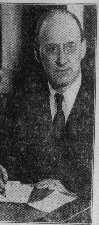
Henry Morgenthau, Jr., of New York, who was appointed secretary of the treasury succeeding William Woodin, takes over his duties. Here he is at his desk in Washington.