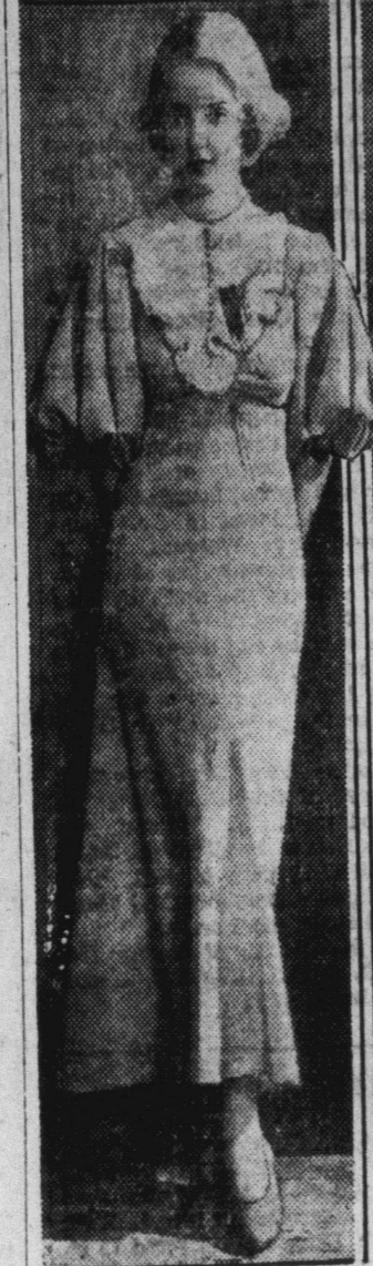
Here is a smart new frock for teatime wear. Worn by Ette Davis of the film, it is fashioned of chiffon in a beige shade and features puffed sleeves and a fancy jabot.