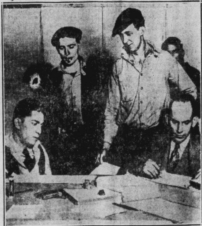
Weirton Steel company employees at Weirton, W. Va., are shown casting their ballots in the disputed election of employees' representatives for collective bargaining.