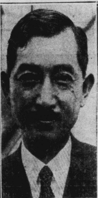
Hiroshi Saito (above), the youngest man ever picked for the post, has been selected as the new Japanese ambassador to United States.