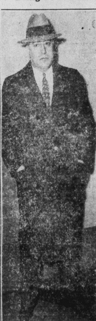
Waxy Gordon, New Jersey "Beer Baron," must serve 10 years at Northeastern penitentiary, Lewisburg, Pa., and pay fines and assessments of $90,000 for income tax evasion. Here he is shown as he was being taken to the federal house of detention.