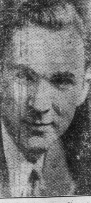
Lee Tracy, American film actor, was jailed in Mexico, D. F., on a charge of offending public morals. He is alleged to have appeared nude on the balcony of a hotel.